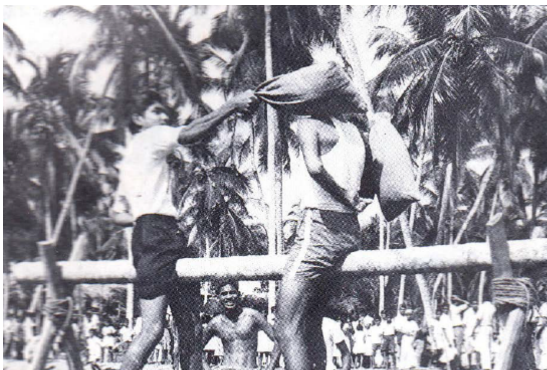
A pillow fight - a typical event at the New Year celebrations in a village.