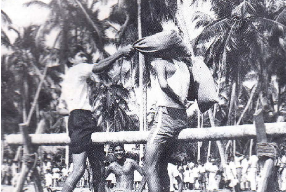
A pillow fight - a typical event at the New Year celebrations in a village.