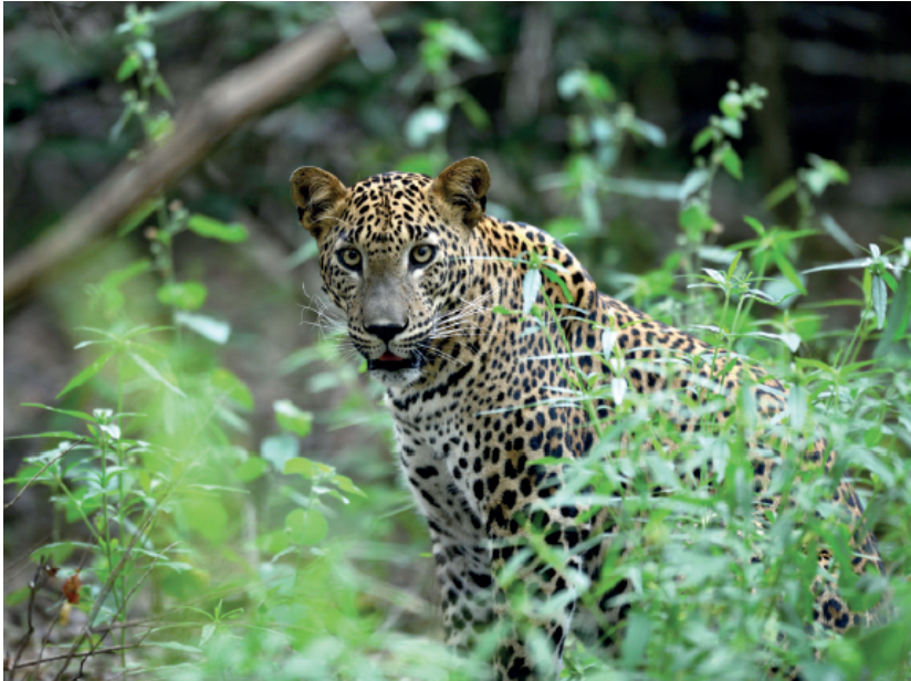
At Nellum Villa.