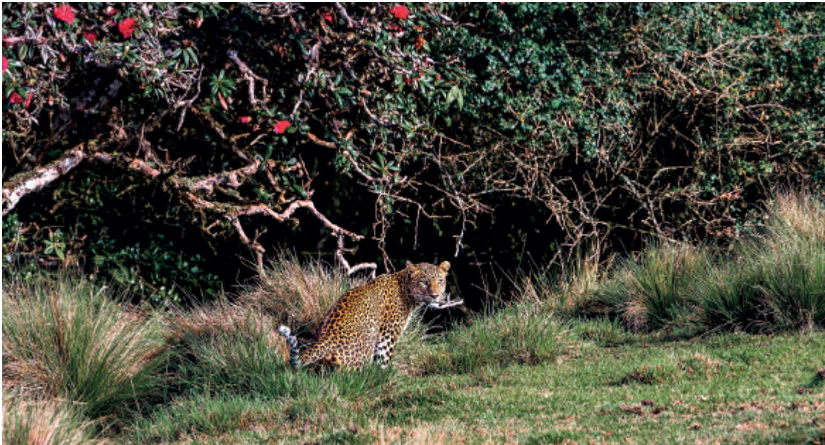
Leopard at Horton Plains.