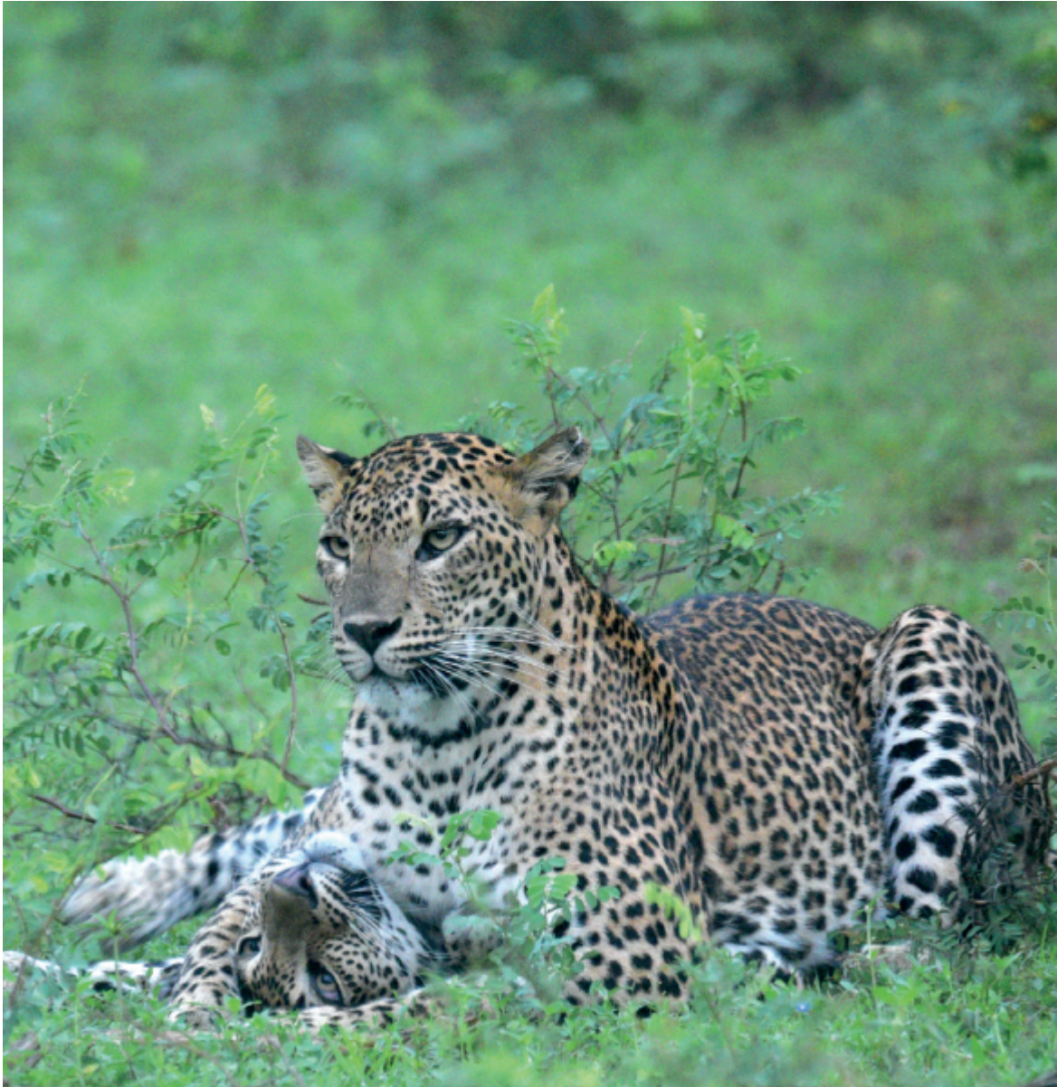
Spot the majestic leopards at Yala.