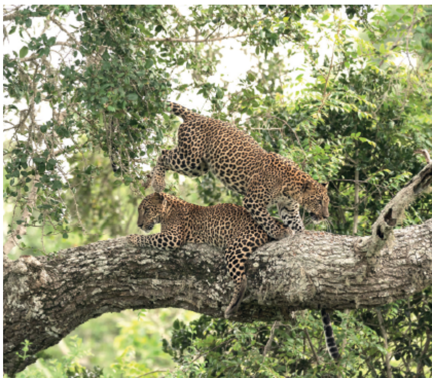
In their territory, at Yala.