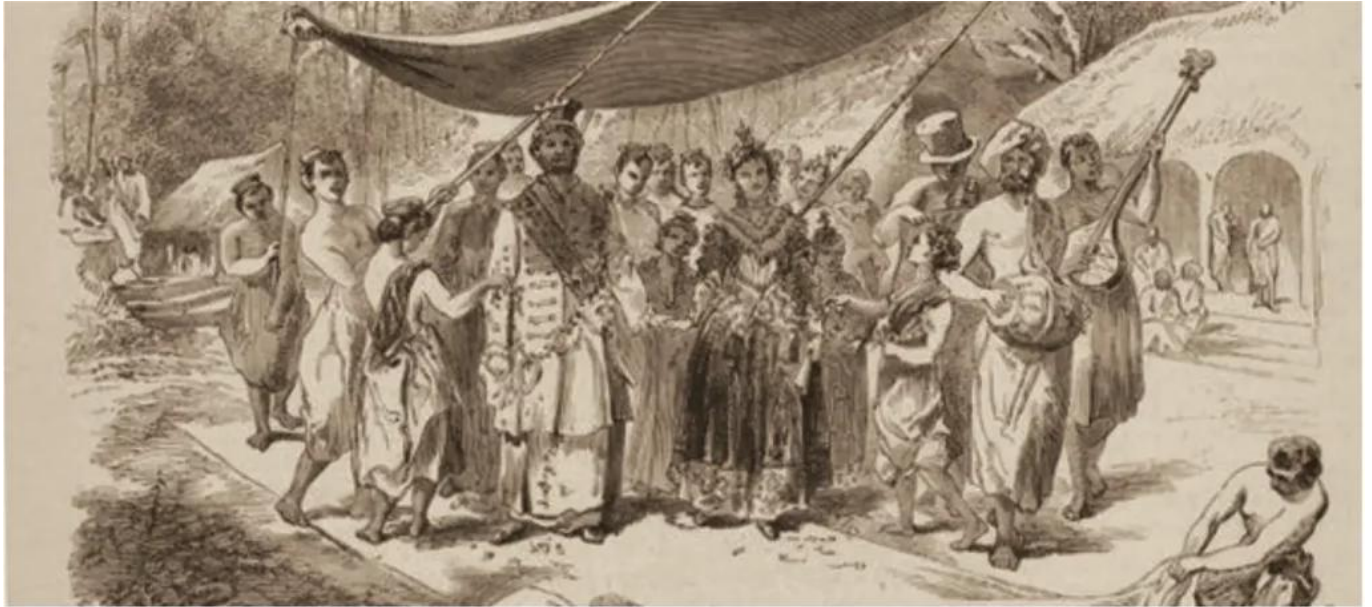
A Southern Karava wedding as seen by a western artist in 1885. Note white canopy and foot cloth of royalty.