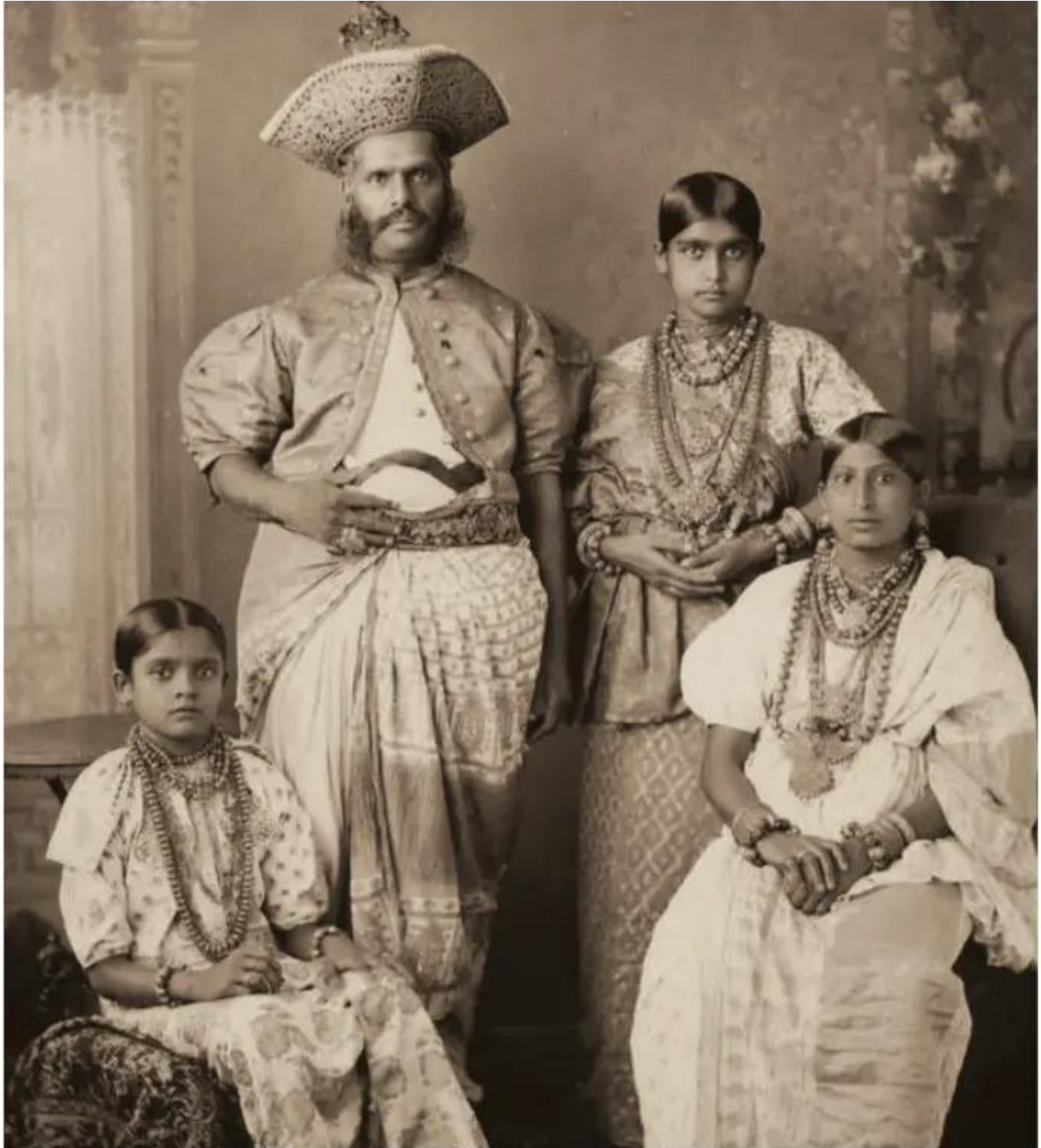
Kandyan Chieftan and his family from interior of the country.