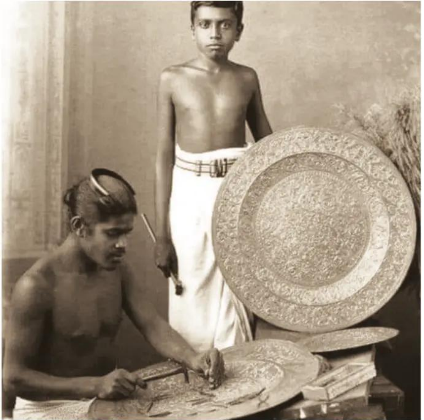
Artisans such as brass workers were of the Achari or Navandanna caste.