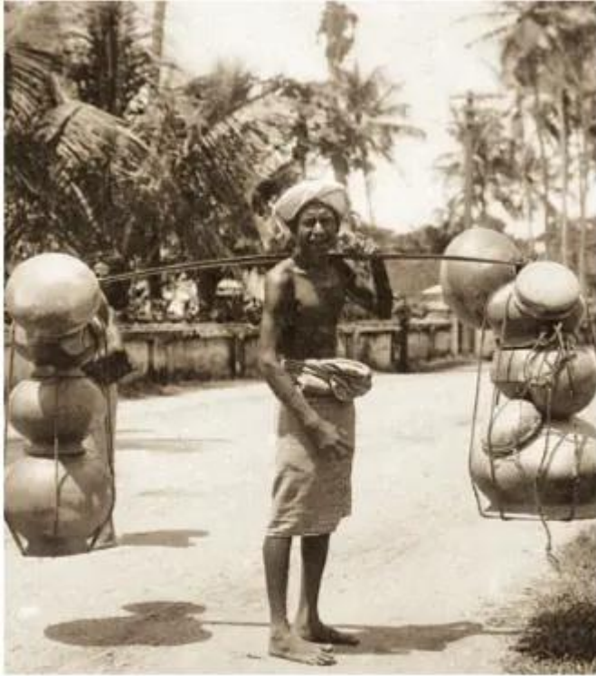
The Kumbal or Badal/Badahala caste provided potters' service.