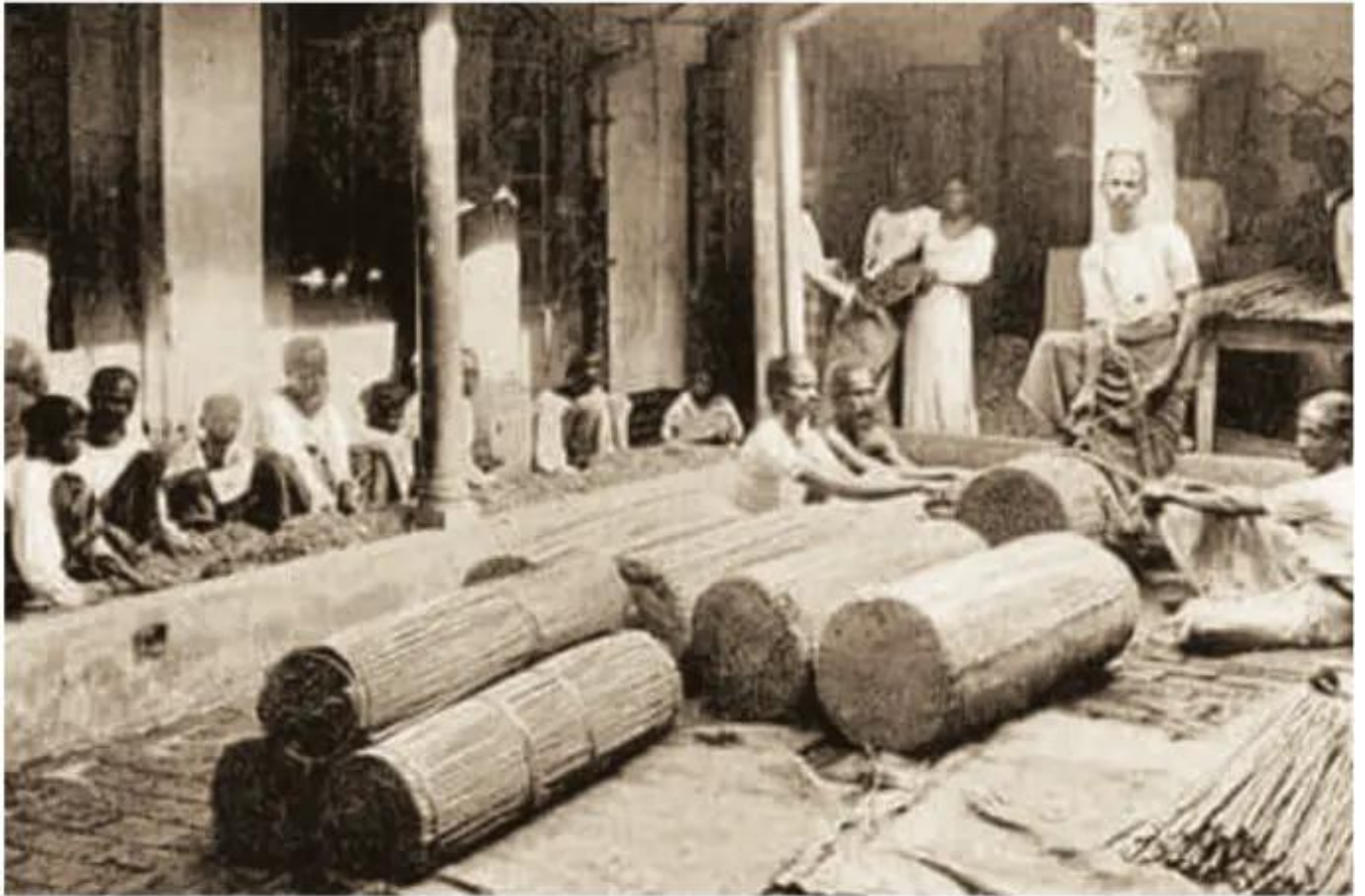
Salagama caste dominated the economic, social, and cultural lives of those parts of the coast where cinnamon was traditionally grown and traded.