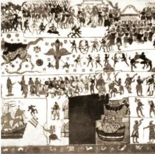
The Salagama Nambudiri flag (Photo credit: Old Ceylon).