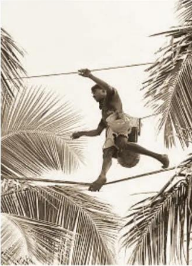
The Durava caste engaged in toddy tapping.