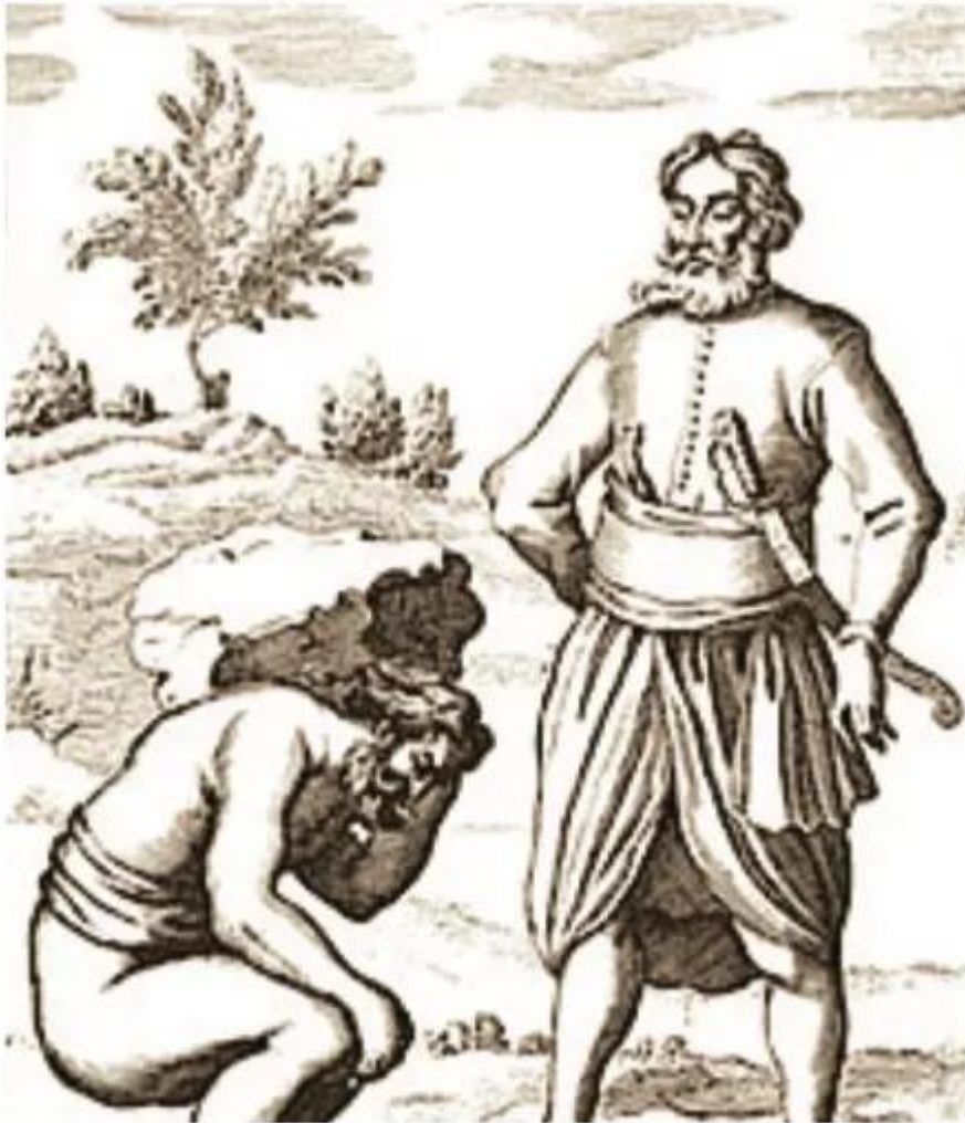
An 18 th -century illustration of a Goyigama officer of the kandyen king supervising a man extorting a fine (Photo credit: Wikipedia).