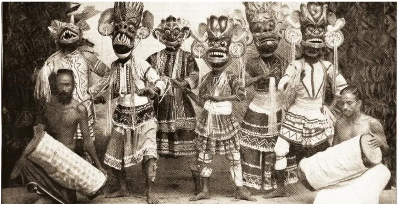
Nekati caste, also known as the Berava caste, were astrologers, drummers, and ritual dancers.