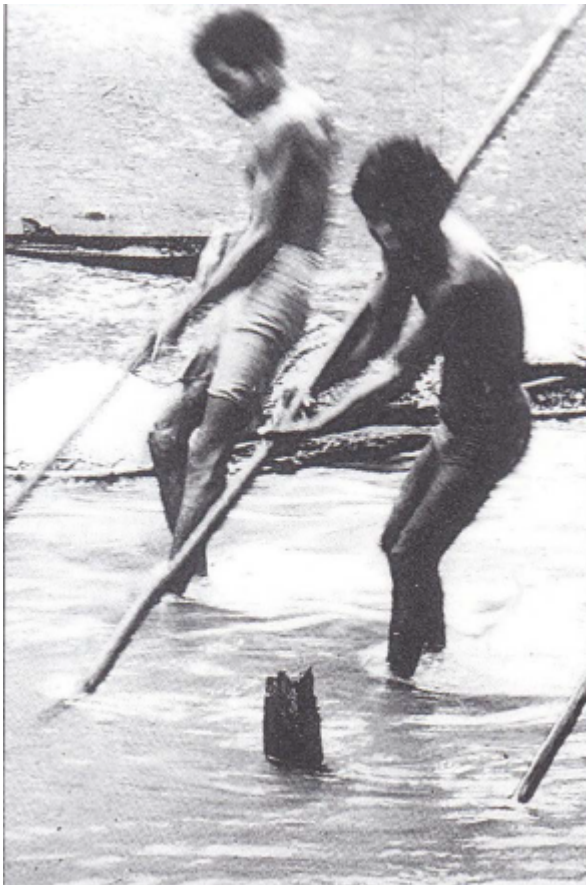
Fishing for gems