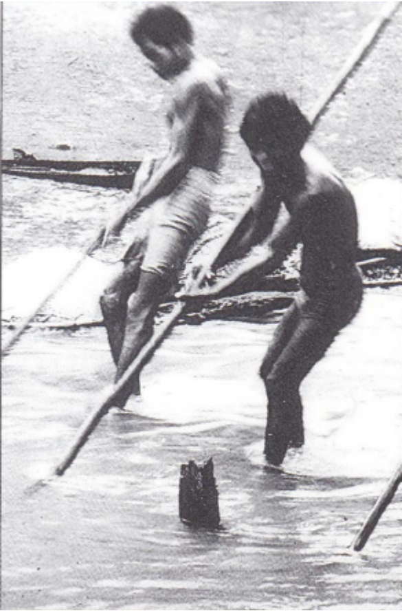
Fishing for gems