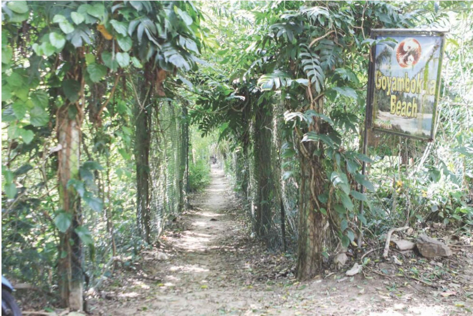
The long narrow path leading to Goyambokka Beach.

Goyambokka has made it to the list of the World's 50 Best Beaches for 2025 for its pristine stretch of sand, calmness, unspoiled nature, and peacefulness where time seems to pause.