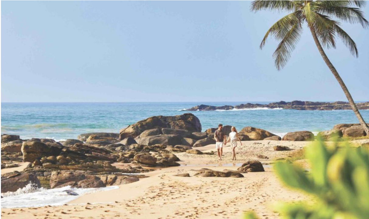
Tourists stroll leisurely along the Goyambokka Beach.