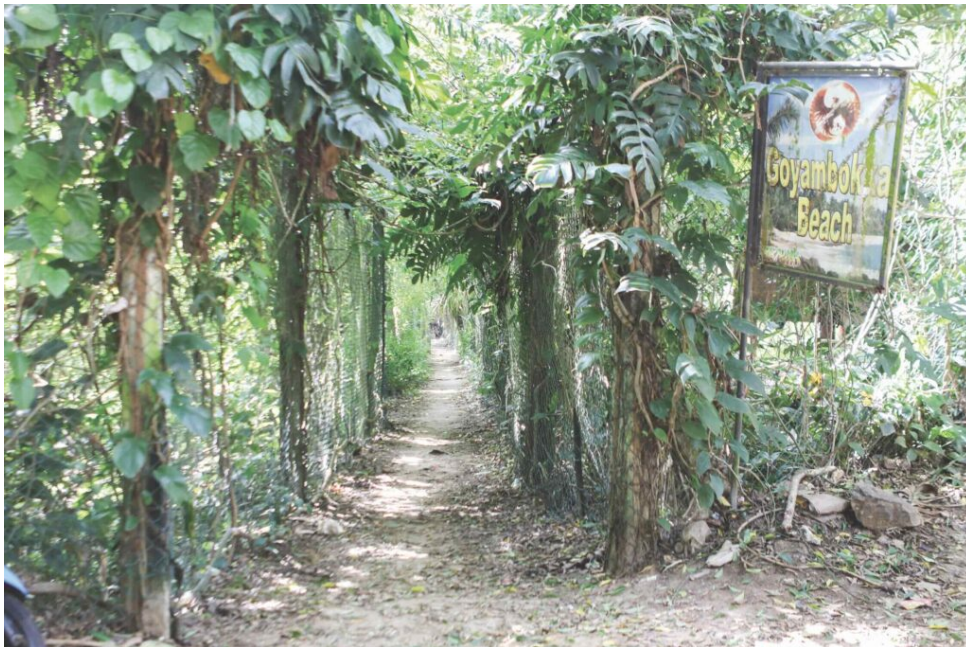
The long narrow path leading to Goyambokka Beach.

Goyambokka has made it to the list of the World's 50 Best Beaches for 2025 for its pristine stretch of sand, calmness, unspoiled nature, and peacefulness where time seems to pause.