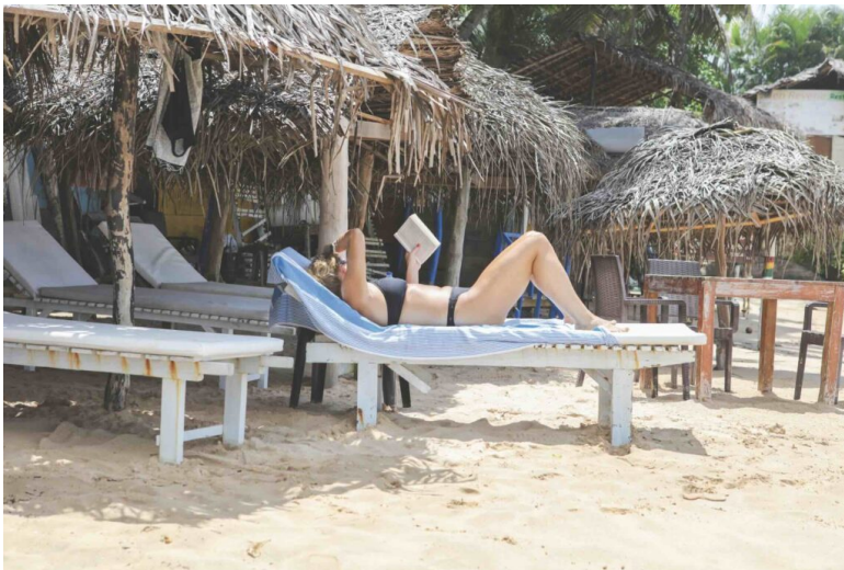
Basking in the golden light.

Though it lay outside the peak season, Goyambokka Beach was highly recommended to a few interested travelers, drawn by its quiet beauty and