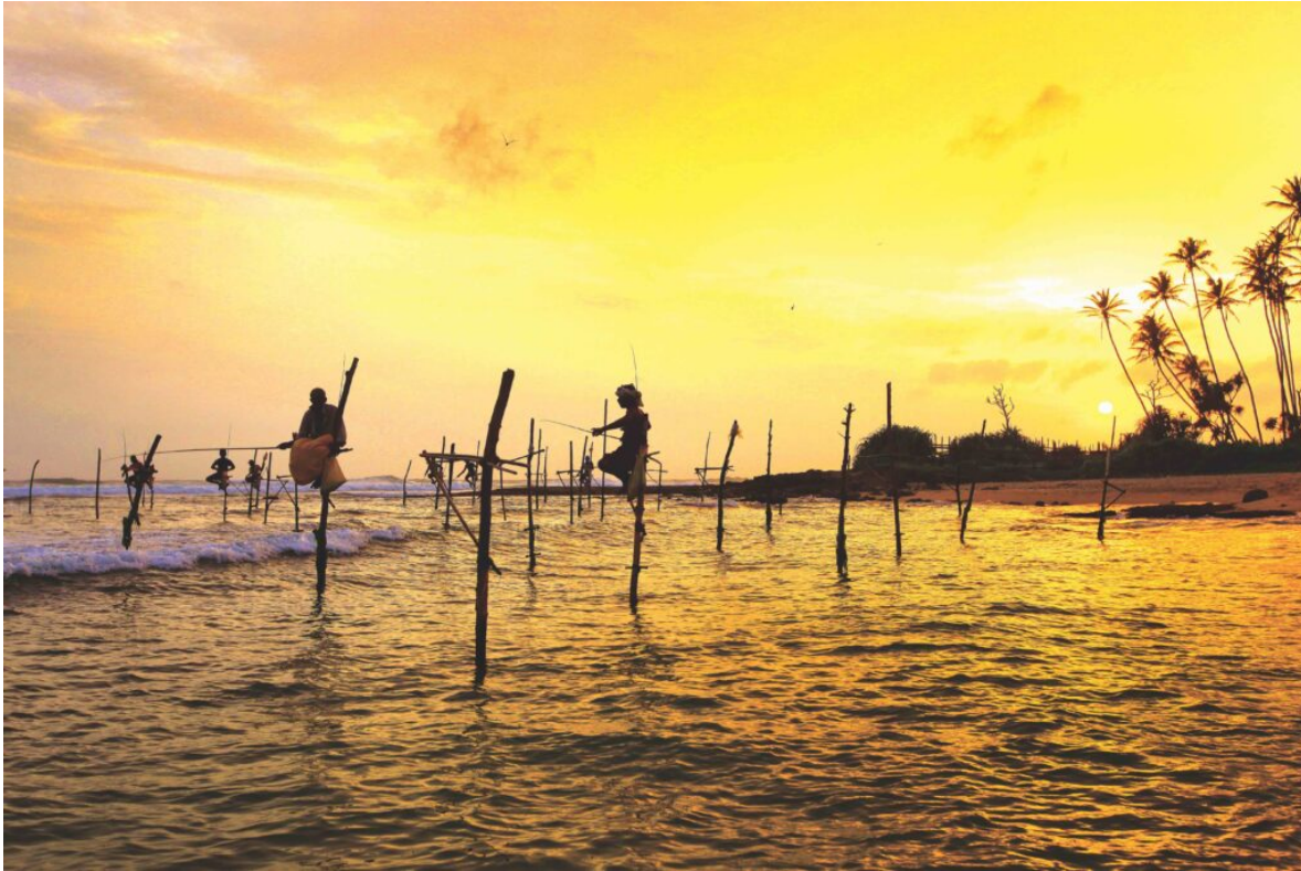
Stilt fishermen in Weligama framed by the shimmering sea.