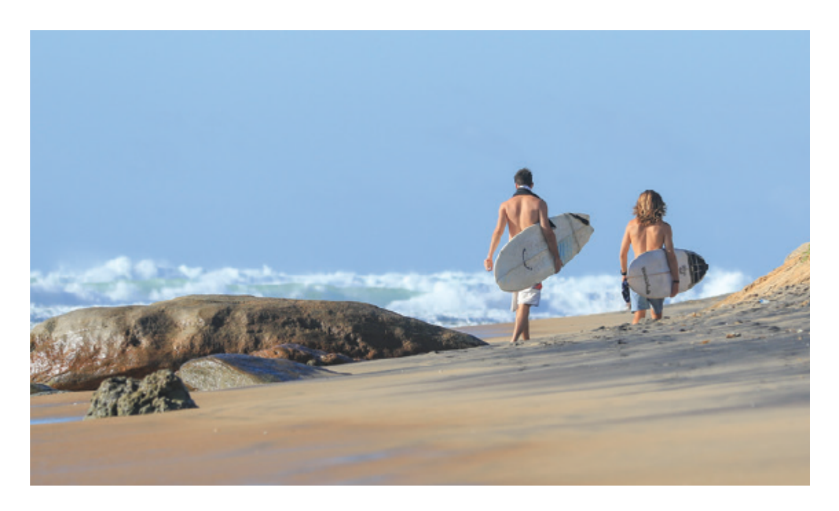
Good swells and wind-blowing makes the East Coast ideal for surfing.