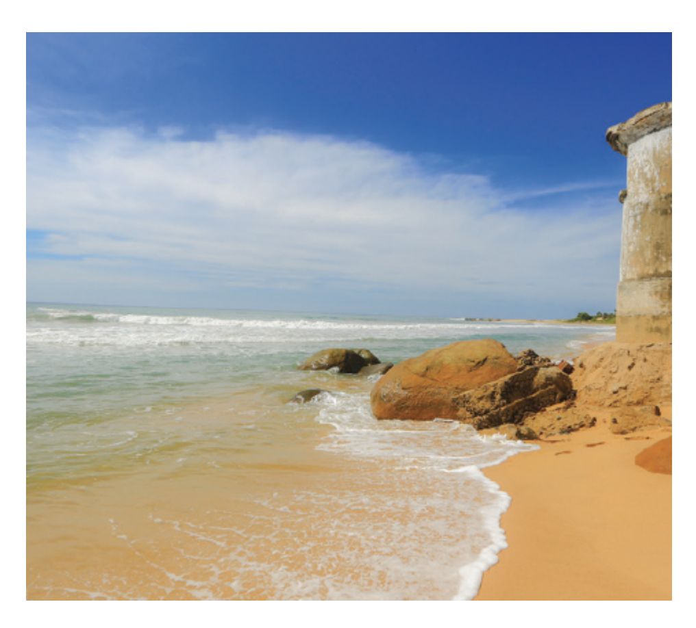
The sunny weather and golden sands complete the getaway.