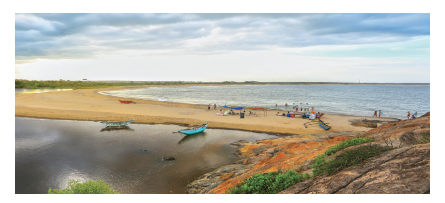
Sri Lanka is one of the best surf destinations in the globe.

waves, Peanut Farm appeals to both beginners and amateur surfers with its exotic natural beauty. Panagala Point in Panama is also known as secret point and getting there itself is an adventure. It is located on a by-road off Panama town. Panama Point is lesser known and therefore less crowded as well, Panama waves can be a pleasant surprise to the surfer. Okanda Point situated near the famed Okanda Temple and along the way to Kumana, picks up swells close to the shore and is more suitable for experienced surfers. The waves are great and the sun is shining in Sri Lanka throughout the year, visit and experience the surf in the East Coast of the island. Arugambay is the place to be!