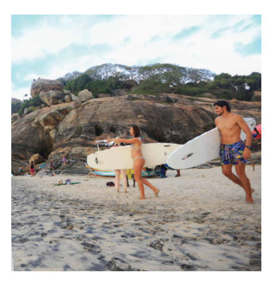
Surfing brings friends and families for an exciting experience.

Madame's Slap is located close to the Arugambay bridge, this point is located at the tip of the Arugambay Strip. Whisky Point near the Urani village, is a mesmerizing area with the sea spreading far and wide. The waves are ideal swells for beginners and amateurs. But as the season progresses, larger waves can be experienced as well. Pros too enjoy the cheerful waves.