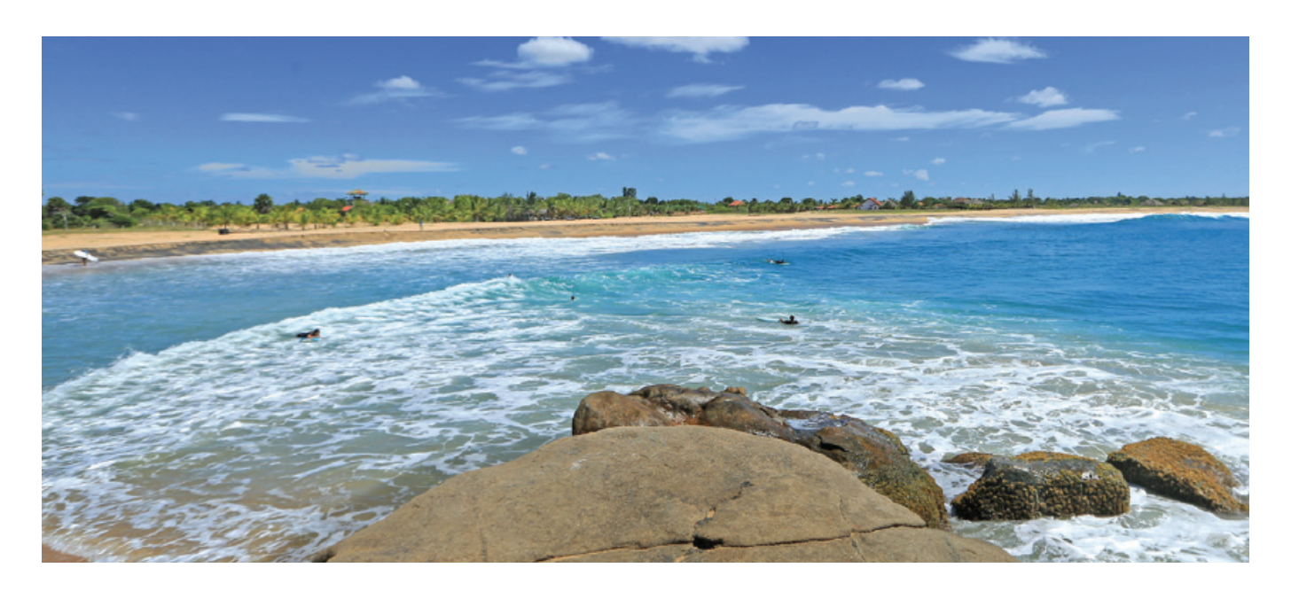
The turquoise waters attracts surfers and sun-seekers.