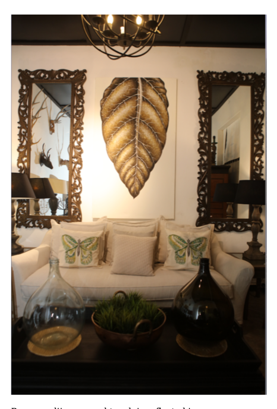
Ruwanmali's personal touch is reflected in every arrangement.