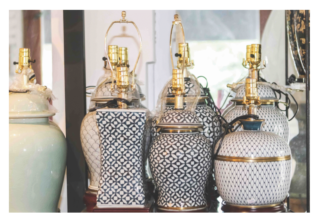
Stylish lampshade bases.

In 2025, Suriya celebrates an incredible 25-year journey—a milestone built on passion, creativity, and a deep love for Sri Lankan heritage.