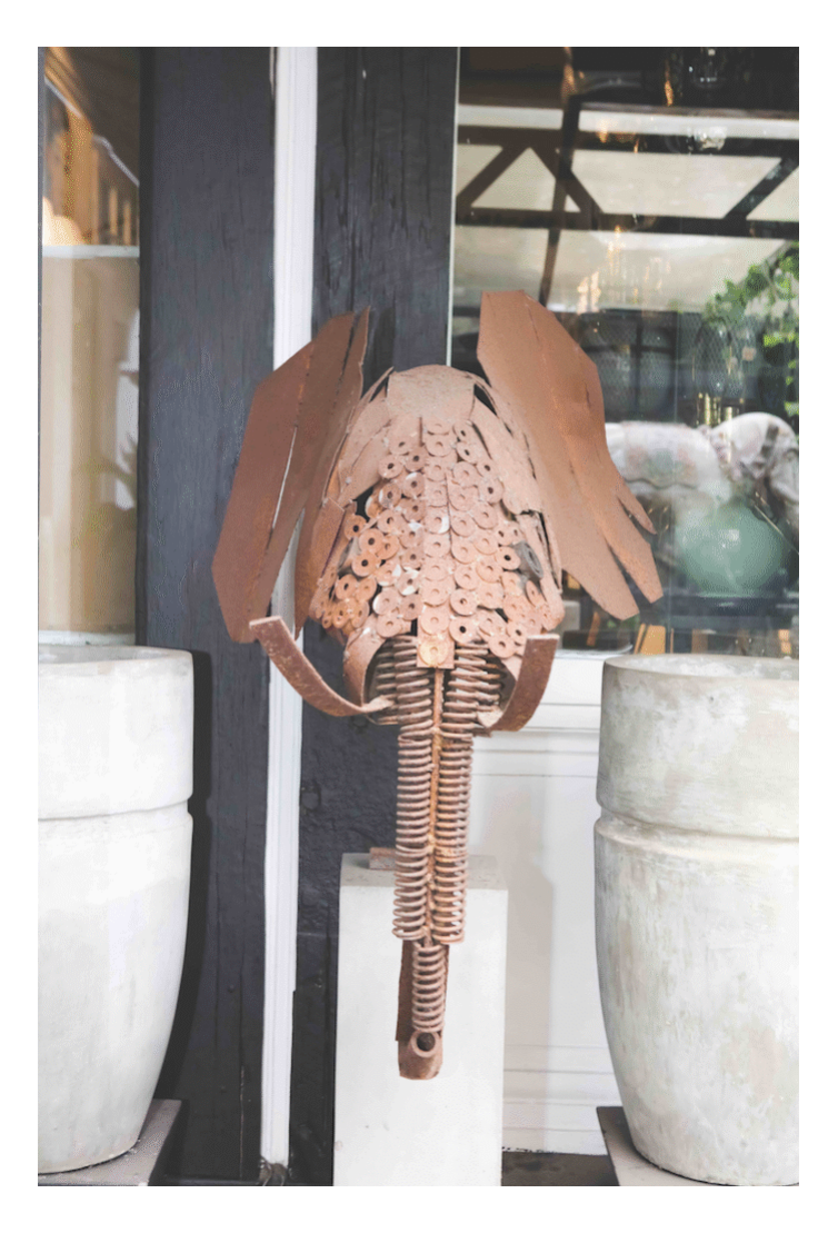
A whisical twist to art.