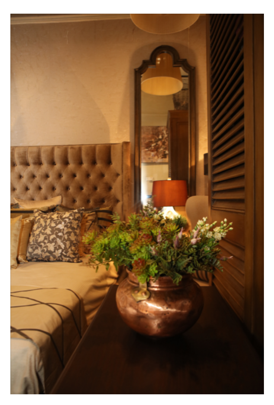
A beautiful spin to every corner.