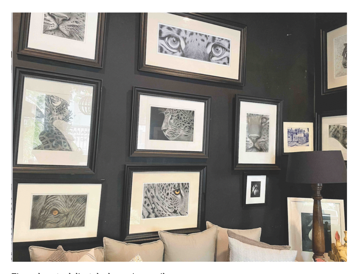
Fierce beauty delicately drawn in pencil.