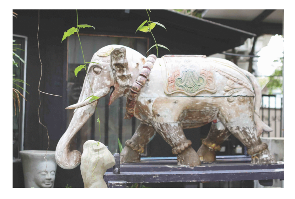
Every decor is a vivid storyteller, weaving tales of artistry and timeless tradition that resonate deeply.