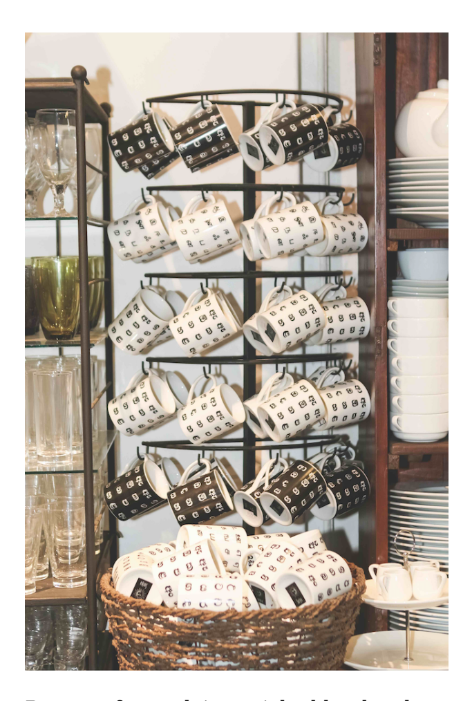
Beauty of porcelain enriched by the elegance of Sinhala alphabet.