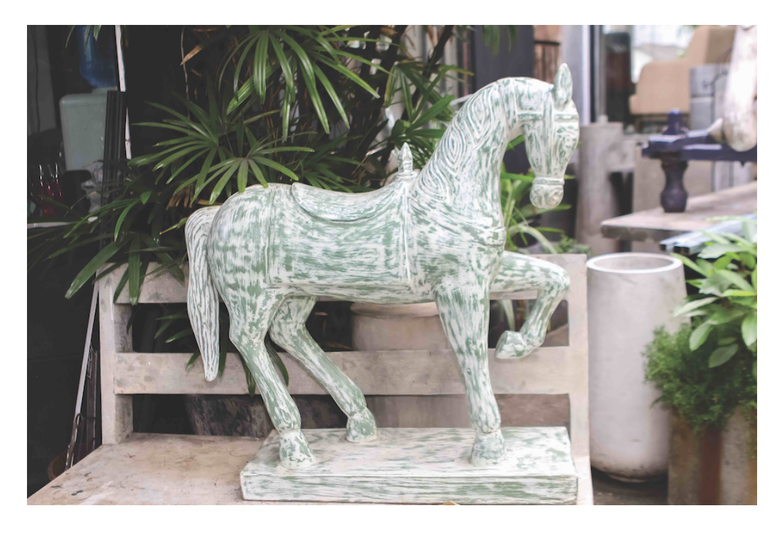
A beautifully carved horse stands in a delicate tottering pose.