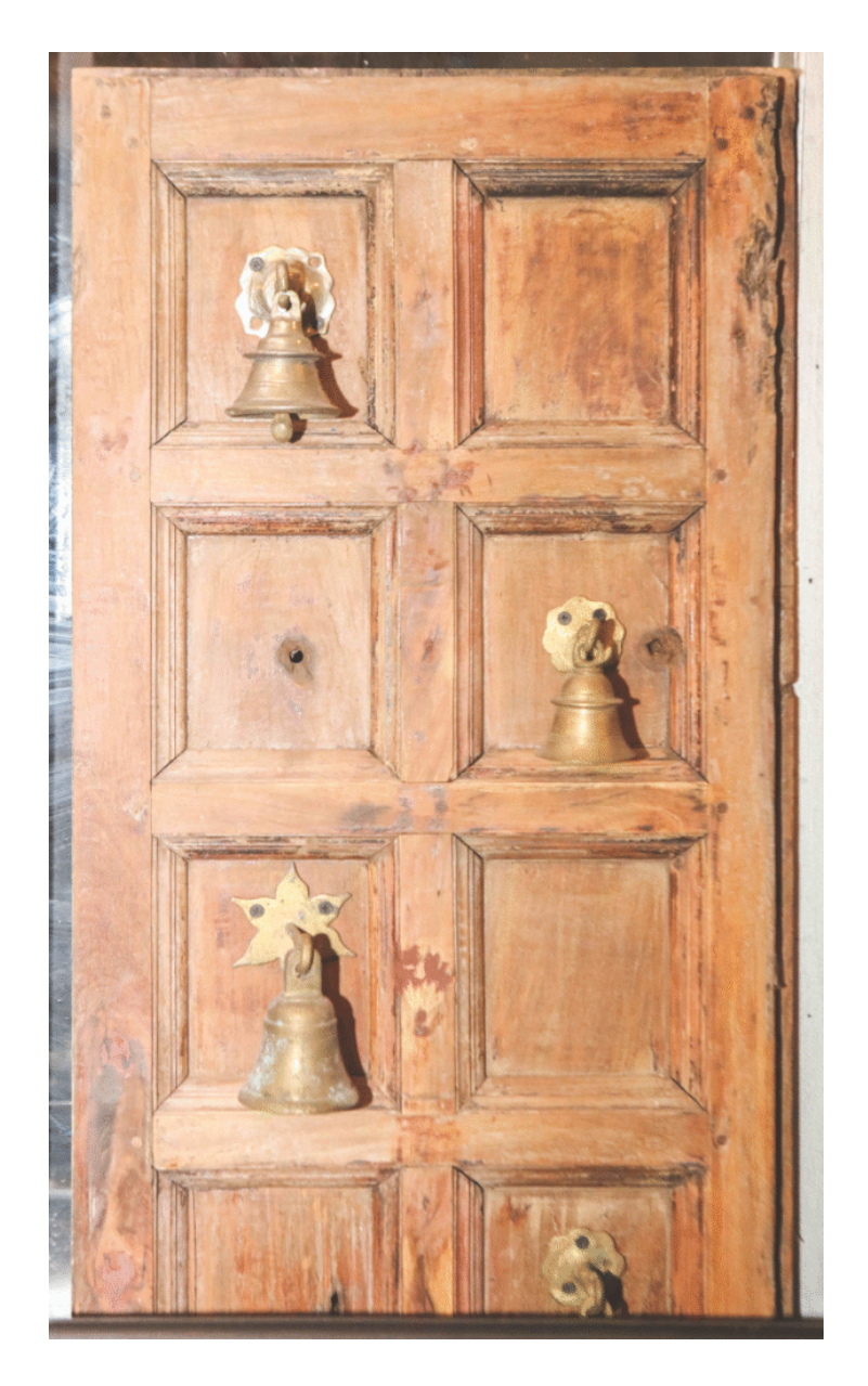
Crafting an entrance with a story.