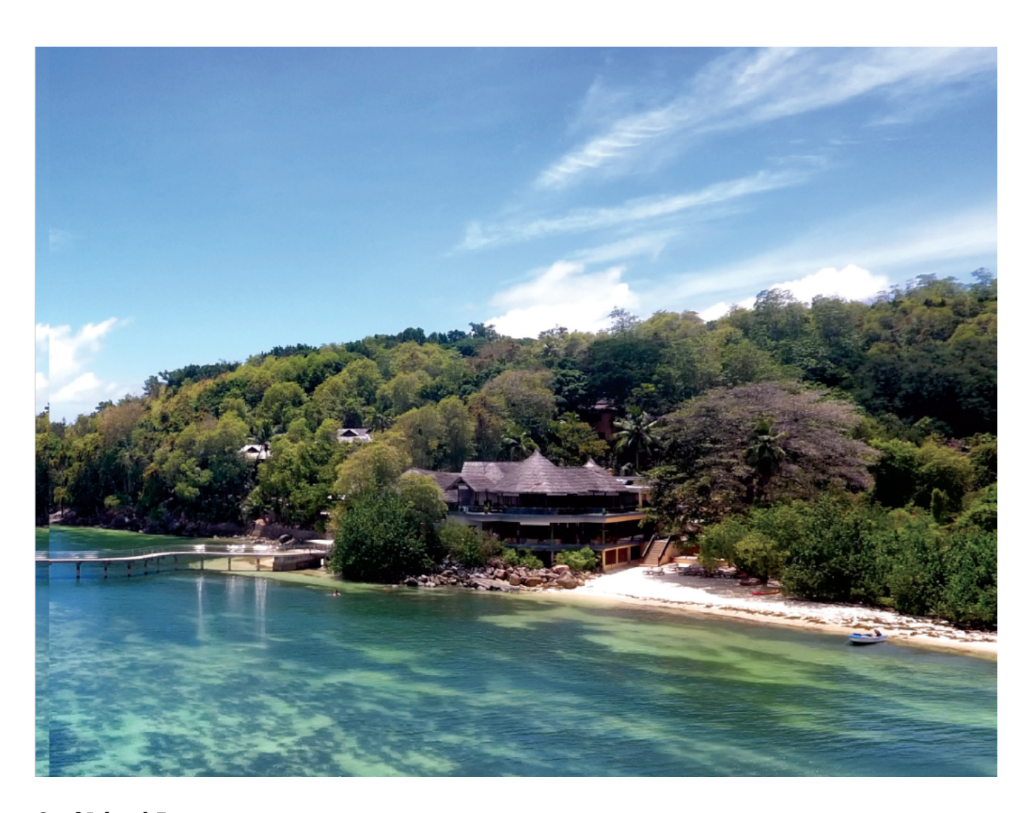
Cerf Island Resort.