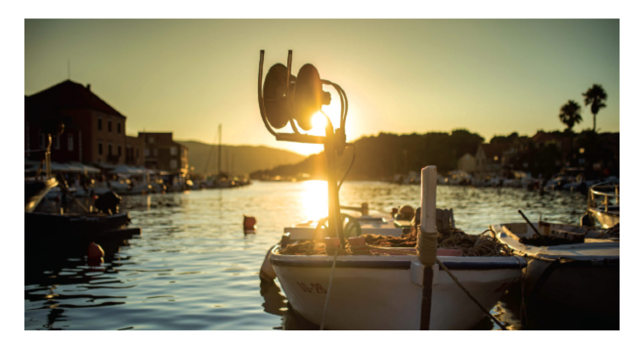
Maslina resort eco hotel harbour.