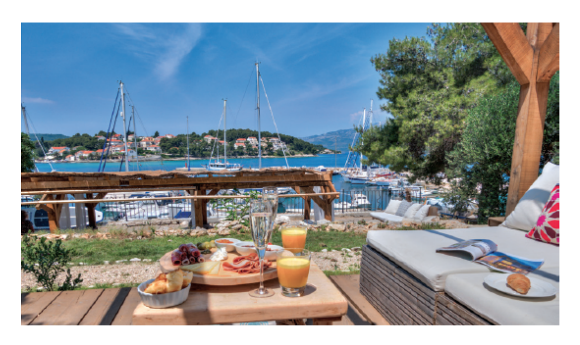
View from The Dreamers Club - Adriatic Pearls.