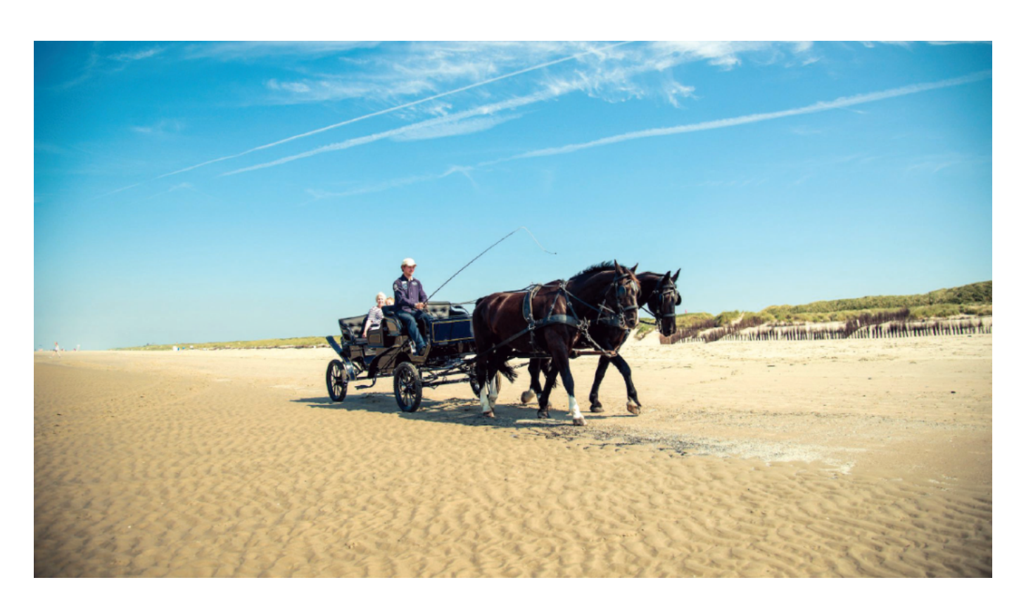
Horse carriages as a mode of transport in some islands.