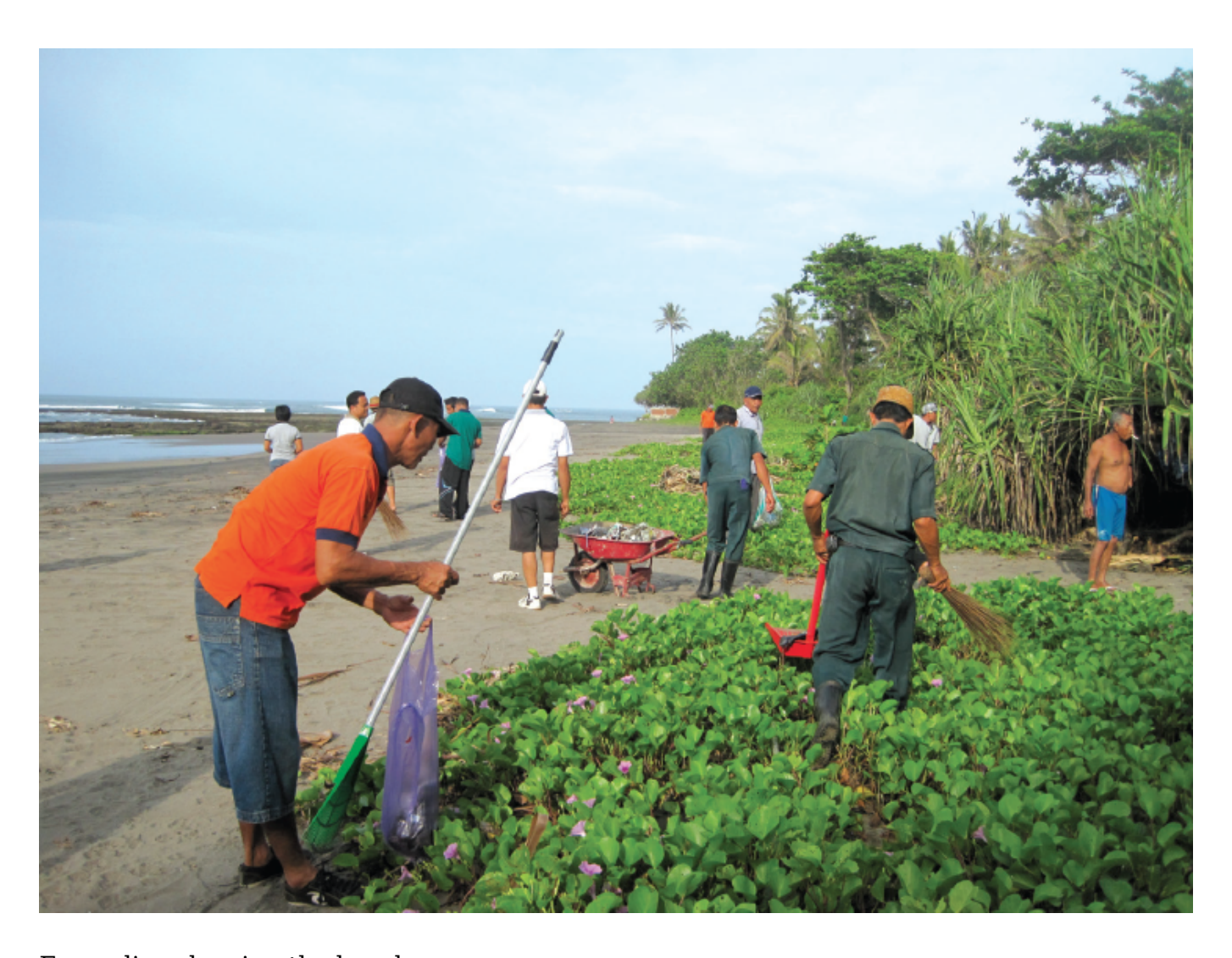
Eco-policy-cleaning the beach.