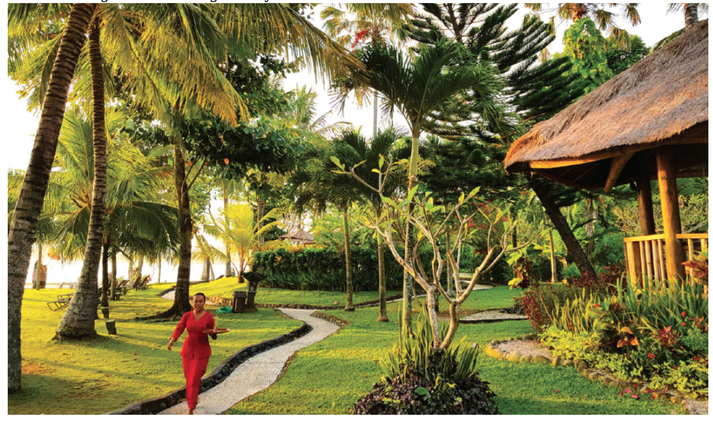
Puri Dajuma on Bali.