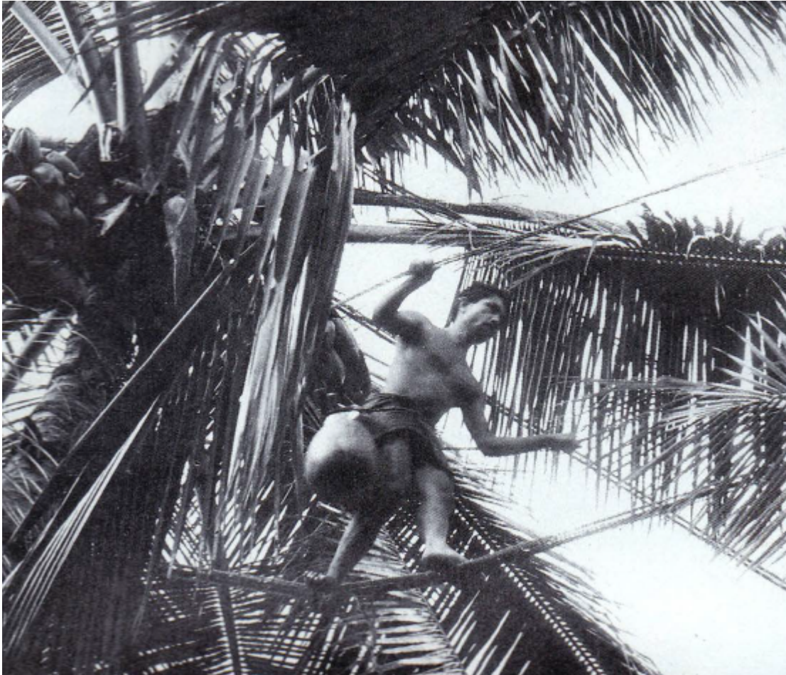
The Toddy Tapper steps on to its aerial ropeway.