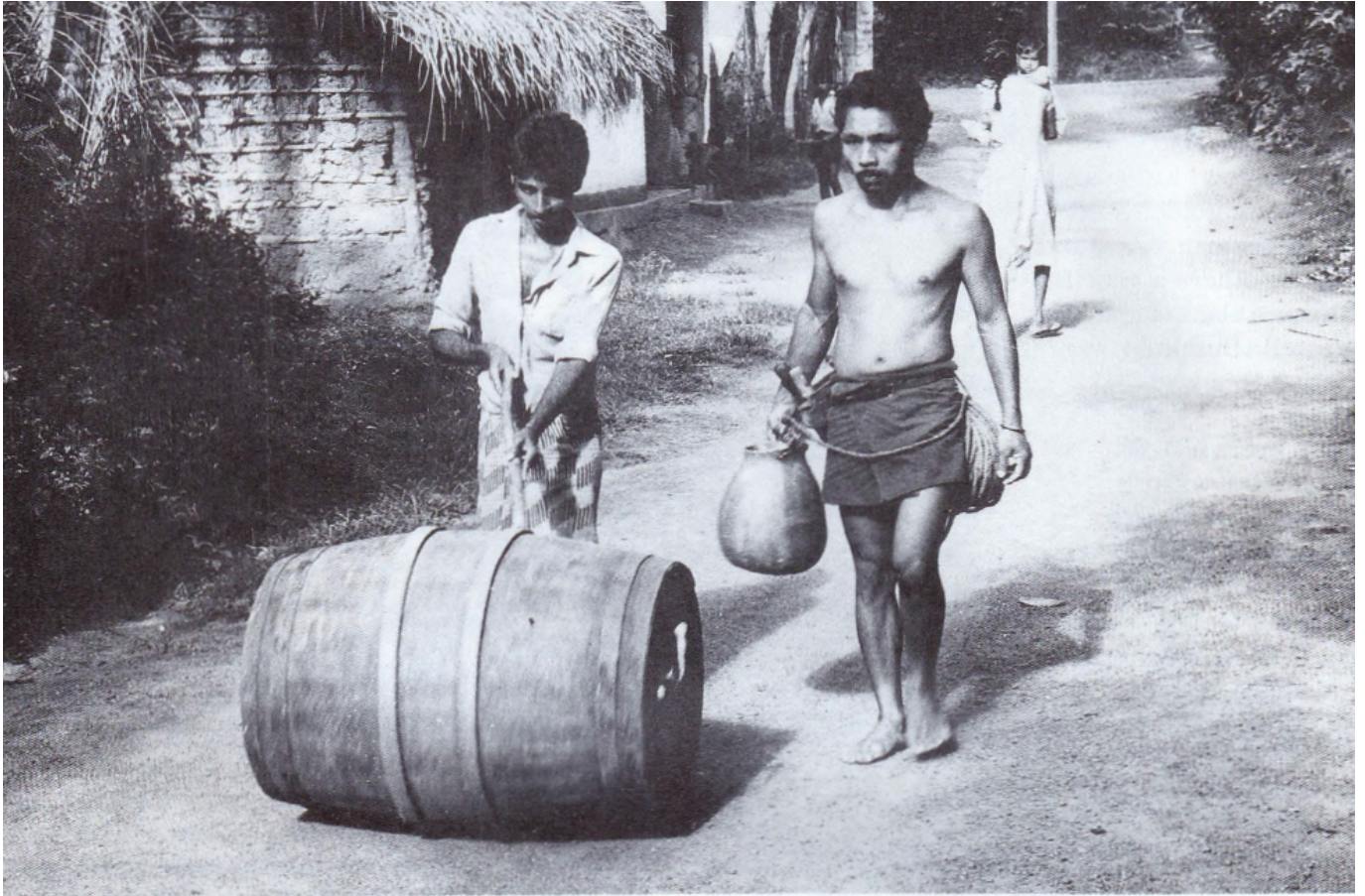
A Toddy Tapper gourd in hand walks beside a barrel of toddy being rolled on the road.