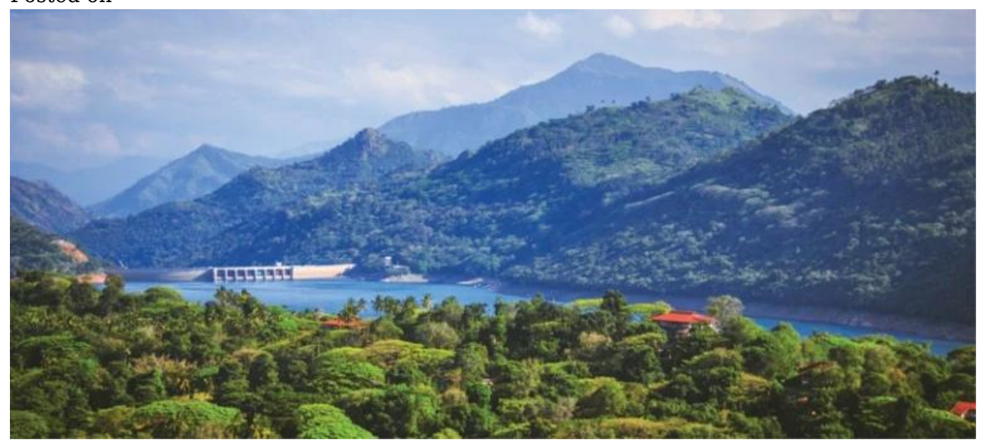
Late afternoon over the Victoria Reservoir, with the golf course in the foreground and the dam in the distance

An ancient temple hidden in the jungle on the far side of the Central Highlands, its origins unknown and unexplored, and home to a dark force with the power to grant victory in war.