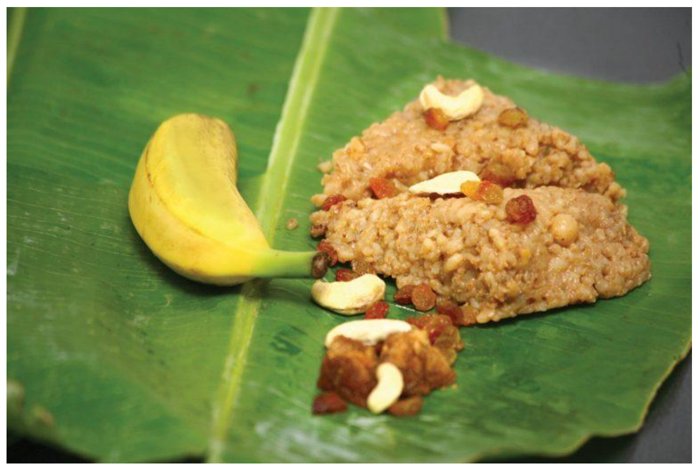
Enjoy a mouthful of sweet pongal.