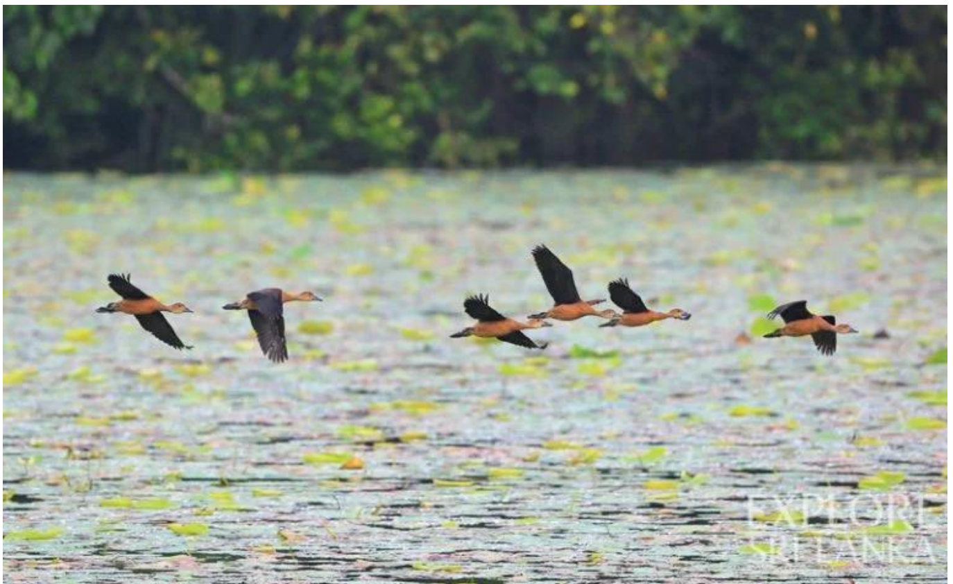
Whistling ducks fly over the tank in elegant formation

Our focus was on a pole that stood tall, several feet from the bund, in the shallow water of the tank. Its presence was puzzling, but what drew our attention was a common kingfisher sitting atop, its azure wings glistening in the pale morning light. We guessed, correctly, that it was waiting for a prey, but what we did not expect was for another kingfisher to swoop in to the same spot. What ensued could only be described as a fight for the best hunting spot. Both took flight soon after, and we decided to take a walk on the gravel road that encircled the tank.