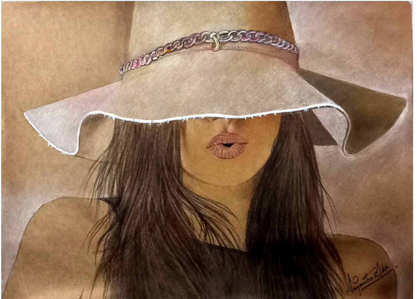
Girl in hat.