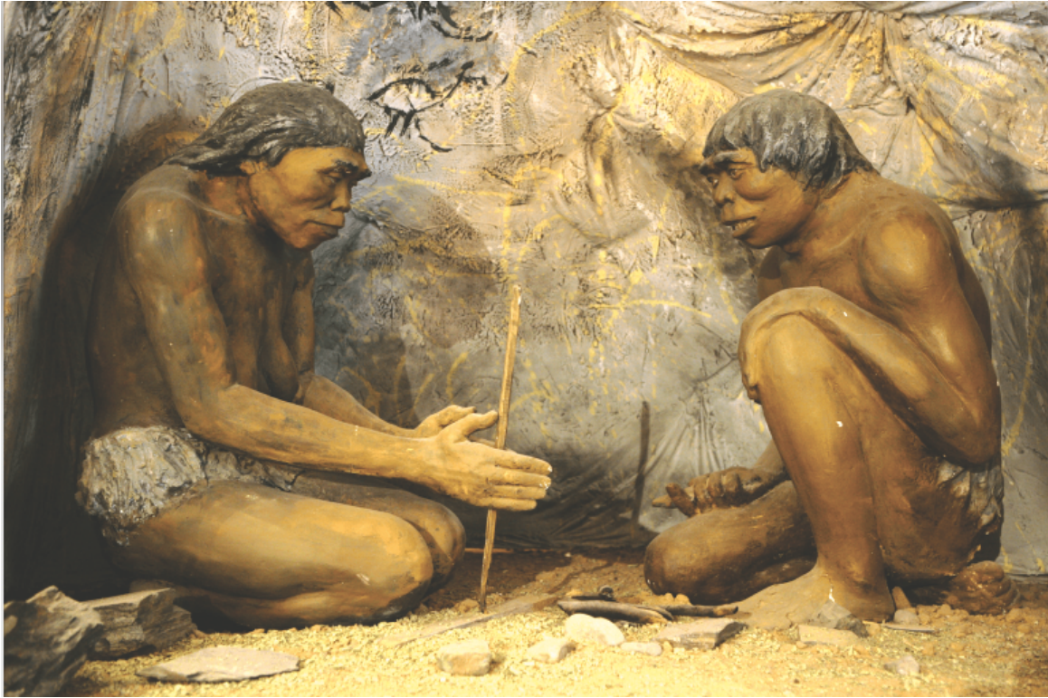
Homo erectus make fire.