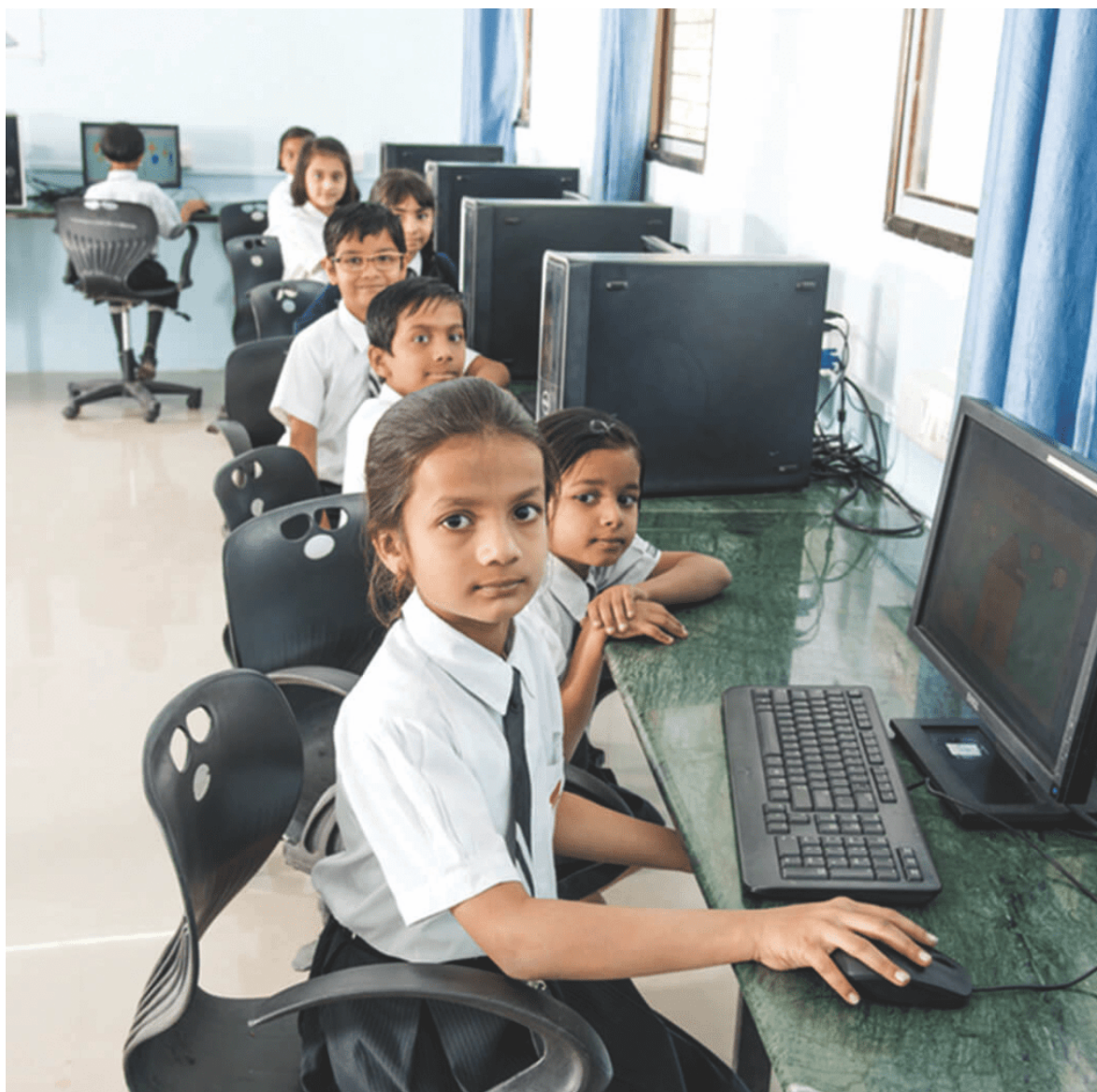
New education system.