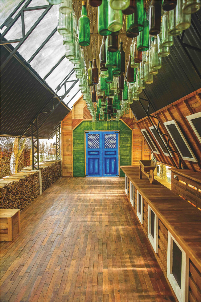
Eatery By The Barn (Restaurant).