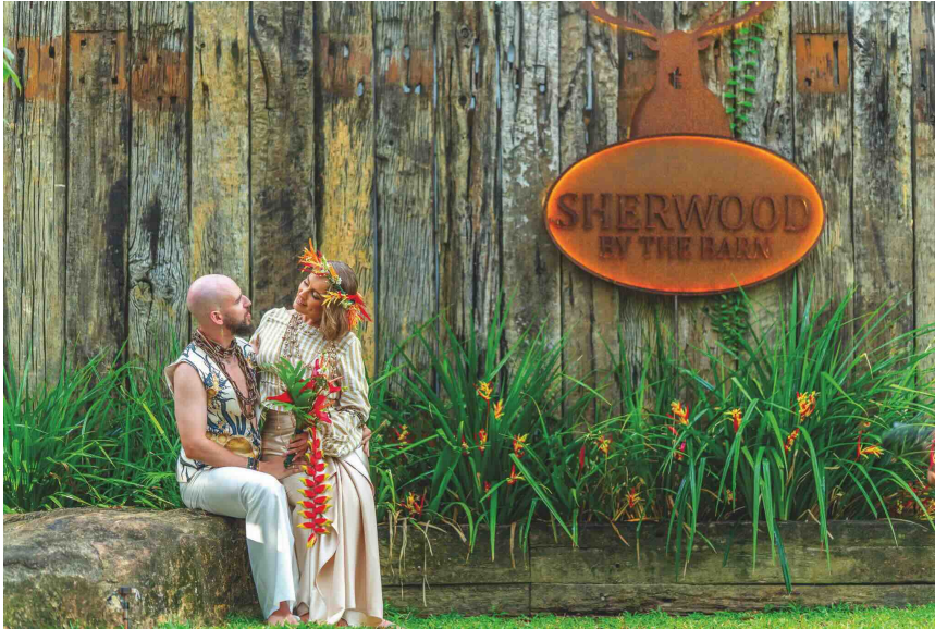
Sherwood by The Barn—Sri Lanka’s first sustainable, climate-friendly venue.

Wooden huts with thatched roofs serve as lounging areas, including a restaurant open from 11 to 11 and a swimming pool. The management sources supplies, laundry, and employment within nearby villages to reduce energy costs and support local livelihoods, keeping operations within a defined radius. Adhering to sustainability commitments—the core philosophy—management innovates in response to external changes. The energy crisis highlighted the need for less energy-intensive options.