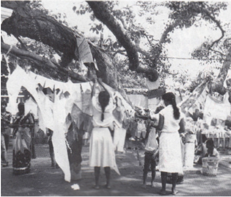
Devotees hang prayer flags on the branches of the sacred tree.