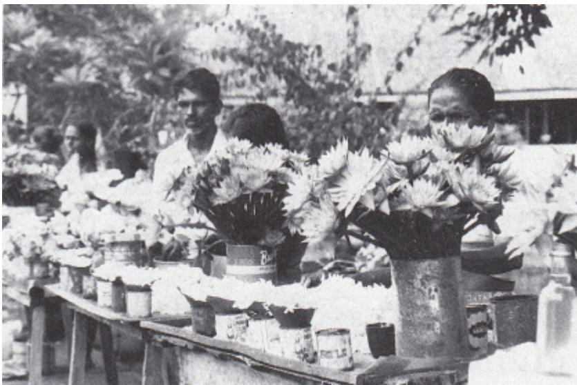
Lotus and Water Lily to be offered at the Kalutara Shrine

construction with flights of steps leading upto a shrine room with four gold painted Buddha statues round the inner dagoba. Seventy five murals depicting the Buddha's life are painted on the inside walls of this structure, that of the Buddha's first incarnation till his birth as Siddharta and the final attainment of Nirvana. The inside of the dagoba is also an echo chamber. A statue of Sir Cyril de Zoysa stands on one side of this Vatadaseya built by a grateful townspeople in remembrance of his tireless work. To the south of the temple grounds is St. John's Church built in 1876, an Anglican church. Kalutara has been famous for its cottage industry of cane and colour-fully woven mats and bags. Striking shades of dyed rush, plaited into intricately woven designs to produce mats, bags, and boxes. The wayside stalls exhibit their wares to the travellers on this ever busy highway. Between May and August is the season for Mangosteen fruits ( Garcinia Mangostana ) which is a speciality of Kalutara. These tropical fruits have a hard purplish brown shell, covering the white fleshy and succulent pulp round the seeds. The vendors build little wayside huts and arrange the fruit in piles to catch the eye of the commuters on the mainroad. Kalutara is 45 km from Colombo on the Galle Road. A bus or train could be taken from Colombo Central bus station or Fort Railway station.