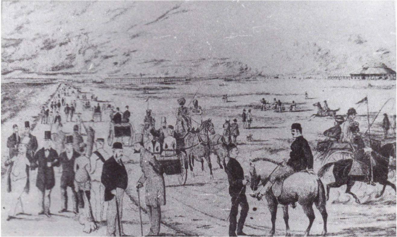
A view of the old Galle Face Walk. The premises of the old Colombo Club which now houses the Club Colombo is seen at extreme right.

The quaint elliptical building with colonial architecture and a panel of windows facing the Galle Face Green which has been preserved in the Taj Samudra premises today was once the grandstand when the green was the race course of the city. These races were well attended by the Ceylonese as well as the Europeans. The Ceylonese watched in silence this novel game of the foreigners who gustily cheered on the horses and riders. In Dutch times, on this site was a Dutch seminary and adjoining this a Dutch burial-ground. As horse racing grew in popularity a cadjan thatched oval bungalow was built here for the grandstand. The building was the highest point on the Galle Face green and an ideal site in all Colombo for a good view of the races on the flat piece of ground in front. In the second half of the last century a wave of Bohemianism swept Victorian Britain and the eighteen sixties saw the formation of some of Britain's leading clubs. The Colombo Club came into existence just one year later. There is a popular belief that the 'club' is an essentially English institution. It is described as a sporting, gambling, political, gastronomic, bibulous, or literary place for gentlemen.