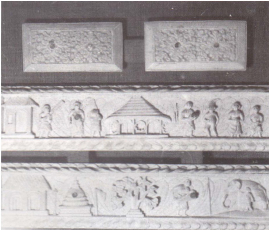
Panels of intricate carvings on ivory.

History also records that of such excellence was this craft that no less than a king of Lanka, Jetthatissa II (circa 331 - 340 AD.), was an “extraordinarily skilful” ivory carver. “He carried out many difficult works and taught the practice of his art to many people...he made a beautiful, charming figure representing the Bodhisattva as beautiful as it it had been produced by miraculous power, as well as a chair of state with a back, an umbrella, a mandapa (hall) with jewels. Here and there (were) all kinds of work by him splendid ivory.