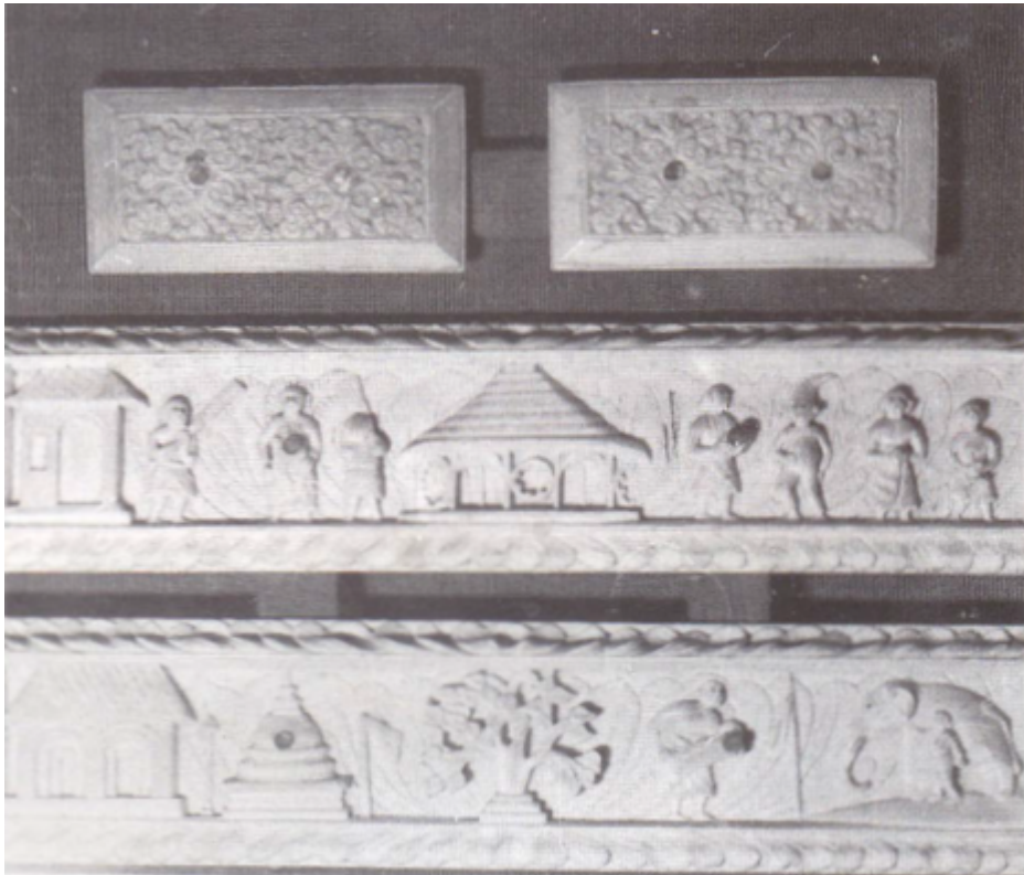
Panels of intricate carvings on ivory.

History also records that of such excellence was this craft that no less than a king of Lanka, Jetthatissa II (circa 331 - 340 AD.), was an “extraordinarily skilful” ivory carver. “He carried out many difficult works and taught the practice of his art to many people...he made a beautiful, charming figure representing the Bodhisattva as beautiful as it it had been produced by miraculous power, as well as a chair of state with a back, an umbrella, a mandapa (hall) with jewels. Here and there (were) all kinds of work by him splendid ivory.