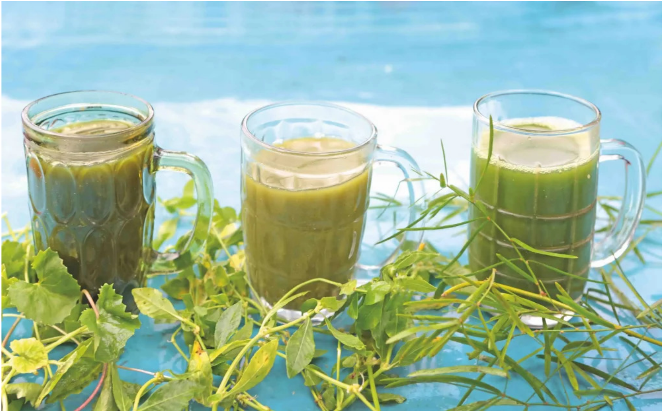
Gotu Kola, Mukunuwenna and Hathawariya kenda.

Most Sri Lankans gulp down a morning mug of Kenda, a veritable magic potion that gives the drinker strength to face the day.