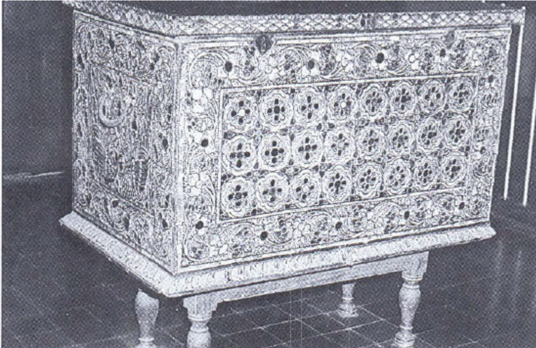
The elaborate chest with carved floral motifs and studded with gems