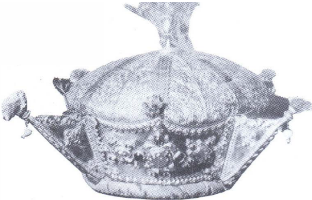
The royal crown and sword.