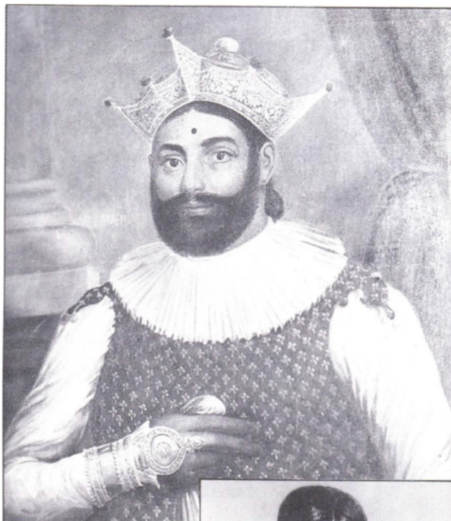
The last King of Kandy, Sri Wickrema Raja Singha, and his consort, Venkata Rangammal.