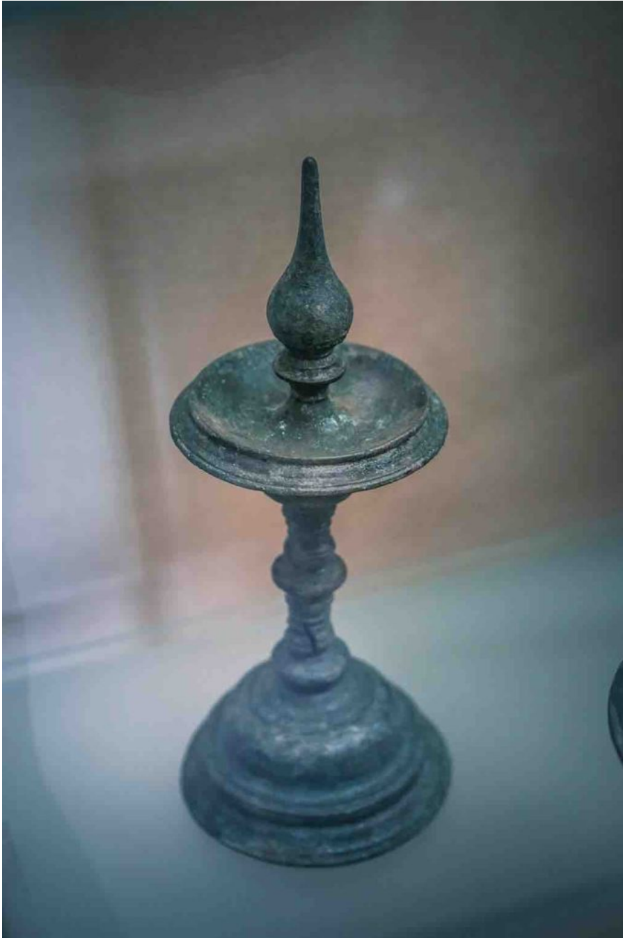
An ancient lamp with an elegant design.