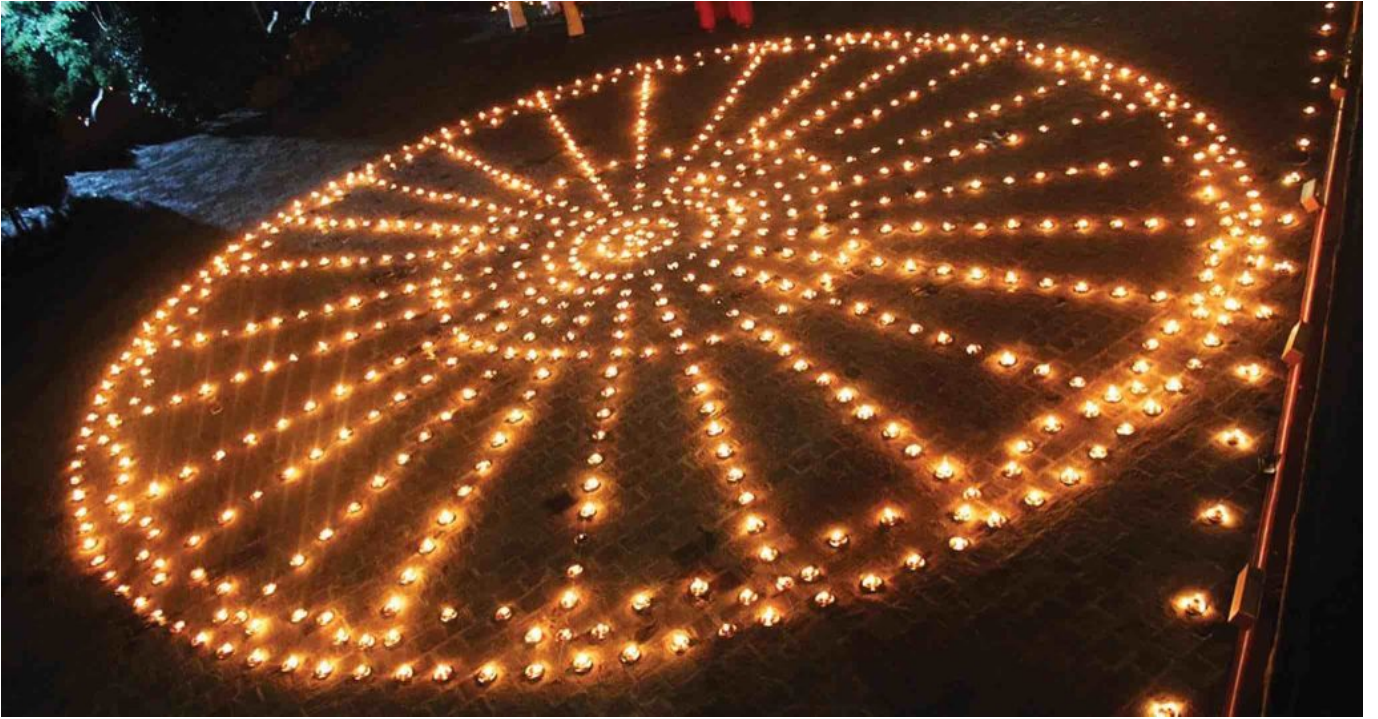
Lighting of lamps resembling the Dharmachakra (The Wheel of the Law) - a divine moment.