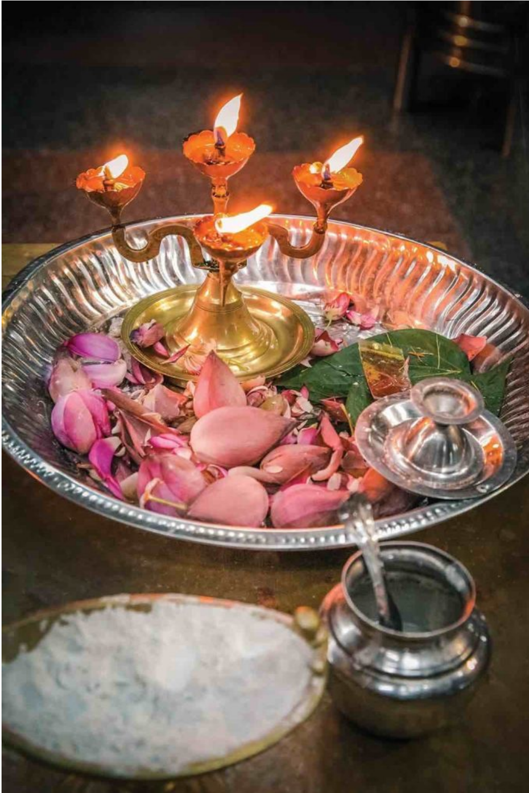
Deepam Pancharati is waved to deities in Hindu Kovils.