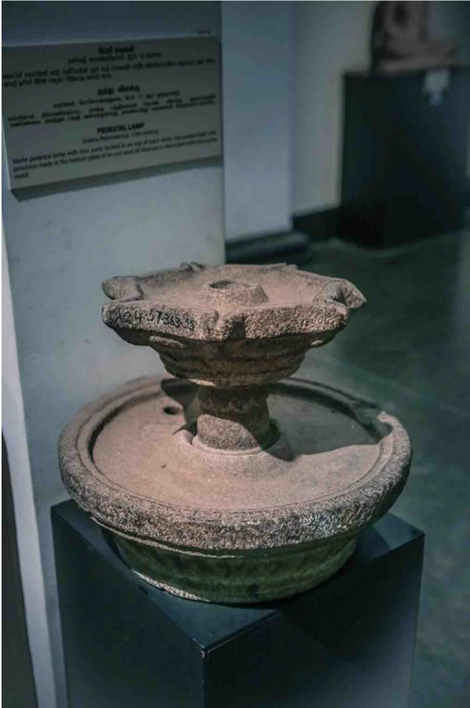
A stone lamp from the Polonnaruwa era.