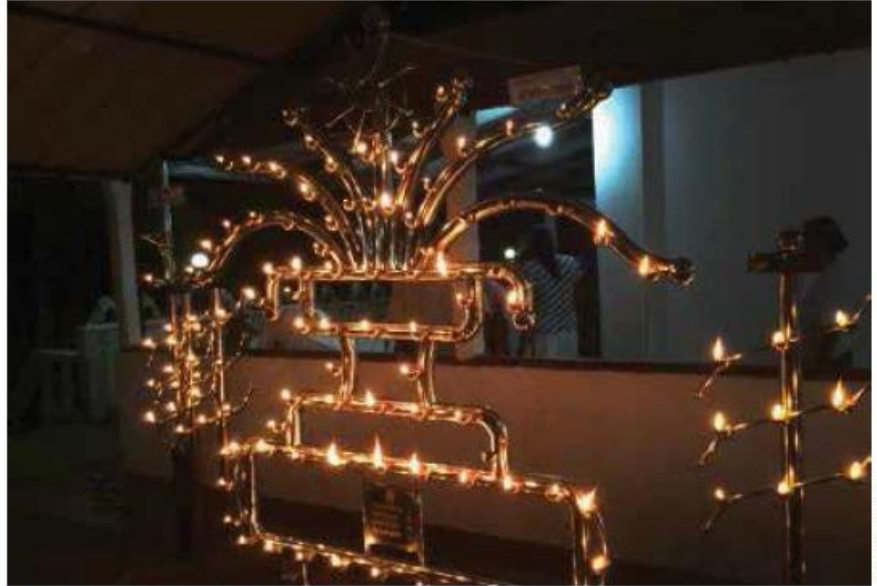
Pahan Pooja at the Buddhist Temple to invoke blessings.