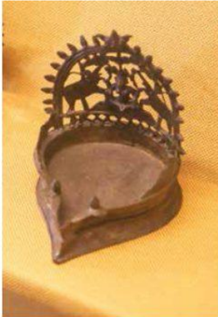
Lakshmi Dheepam is usually found lit in Hindu homes.

Over centuries past, the oil lamp may have changed shape in the convoluted hands of artisans. Still, the energy and grace resident in the lambent flame continues to illuminate the islanders' lives with enduring hope of better things to come.