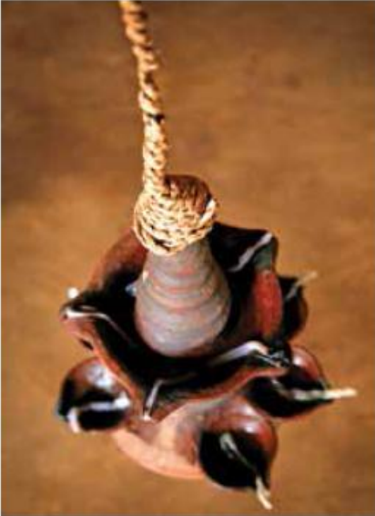
A hanging pahan of unique design embodying culture and radiance.