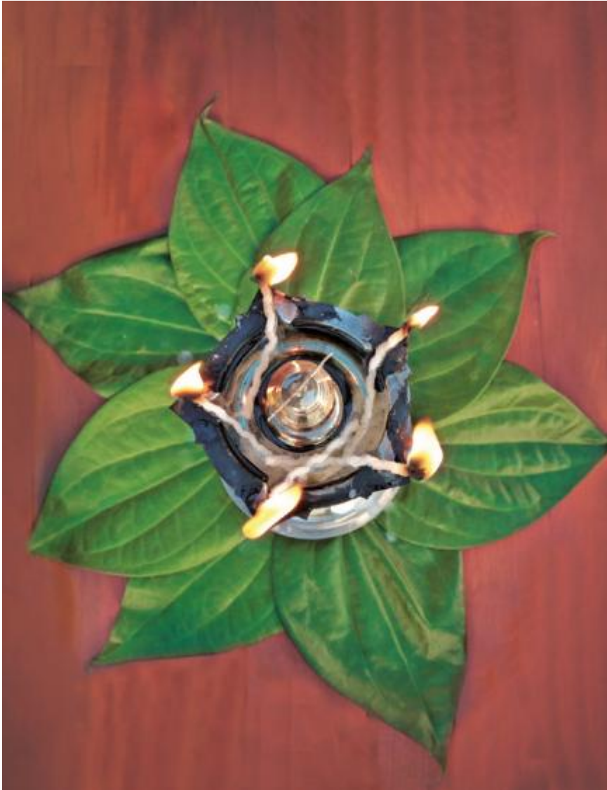
Kuthu vilakku, a traditional Hindu ornamental oil lamp lit at an auspicious event

Sanctuary lamp in Churches, fueled by oil or wax, indicates and honors the presence of Christ