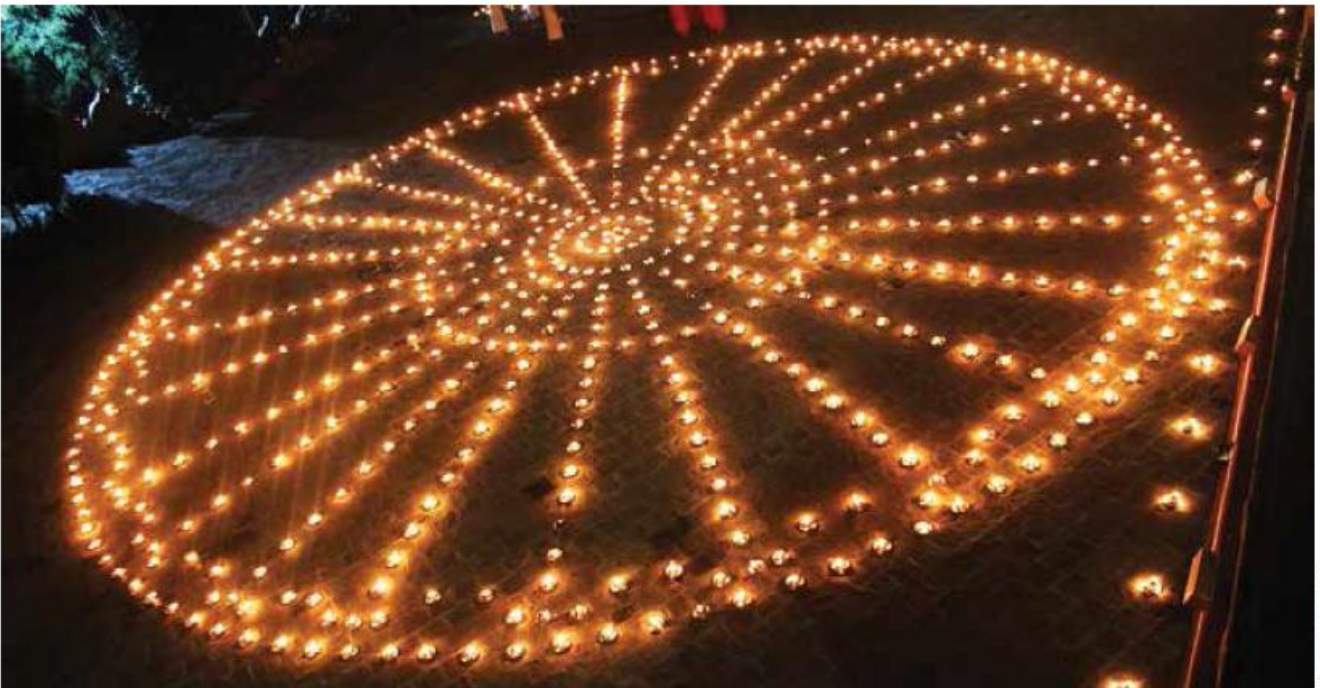
Lighting of lamps resembling the Dharmachakra (The Wheel of the Law) – a divine moment.