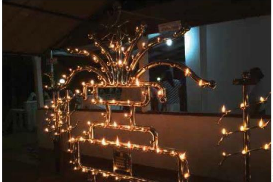
Pahan Pooja at the Buddhist Temple to invoke blessings.