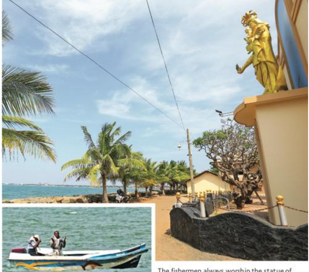
The fishermen always worship the statue of Our Lady of Good Voyage to seek blessings and protection for a good journey and return.