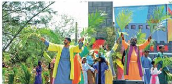
Scenes from the Duwa Passion Play.