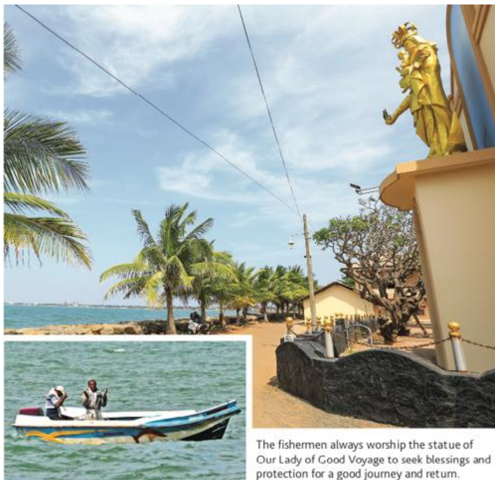
The fishermen always worship the statue of Our Lady of Good Voyage to seek blessings and protection for a good journey and return.