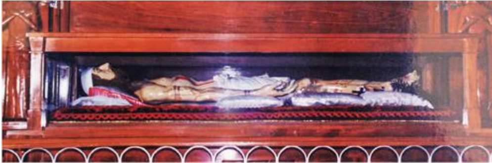
The magnificent statue of Jesus Christ that was specially commissioned for the people of Duwa from Cochin, India.