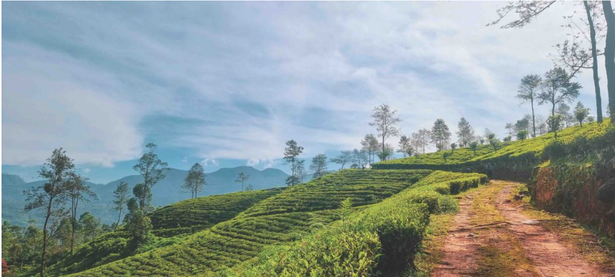
The trail through tea plantations.