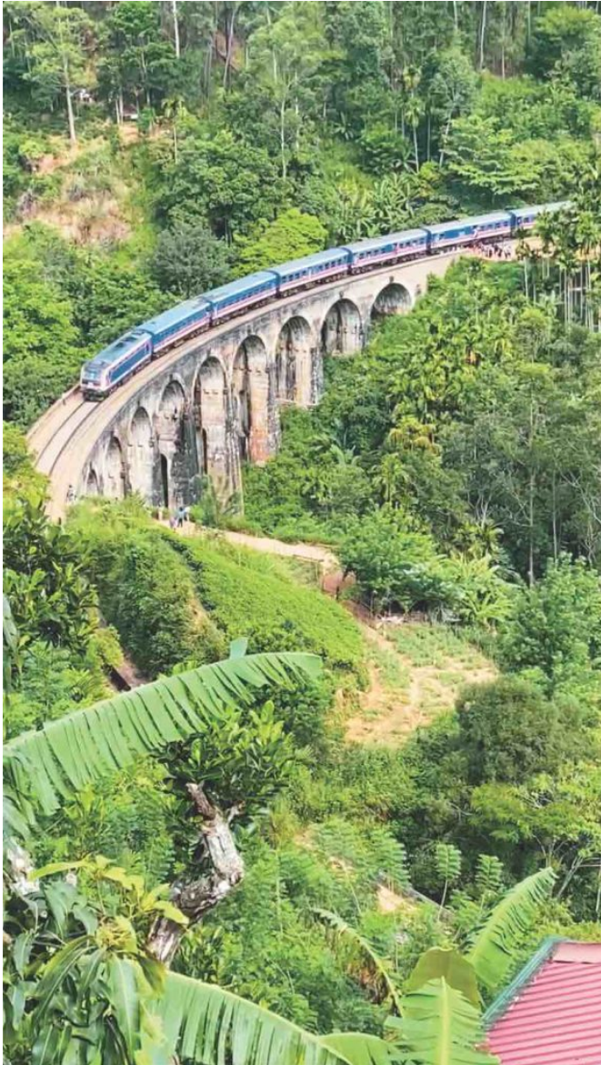
A breathtaking view of the iconic Nine Arch bridge in Ella.

The Pekoe Trail winds through multiple territories, hence the greater responsibility to treat every place respectfully. The Pekoe Trail is set to create new economic opportunities for small and medium entrepreneurs, the tea industry, and tourism. Still, all stakeholders must buy into the ethos of the trail through a cohesive consciousness towards treating the trail with respect and conducting themselves responsibly. Hence, in the Pekoe Trail, everyone participates in the governance of a destination. The Pekoe Trail's website provides a