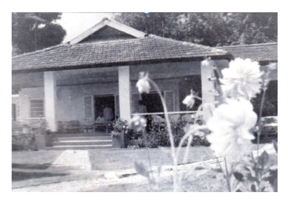
Ella Resthouse with a homery frontage of lawns and flower beds