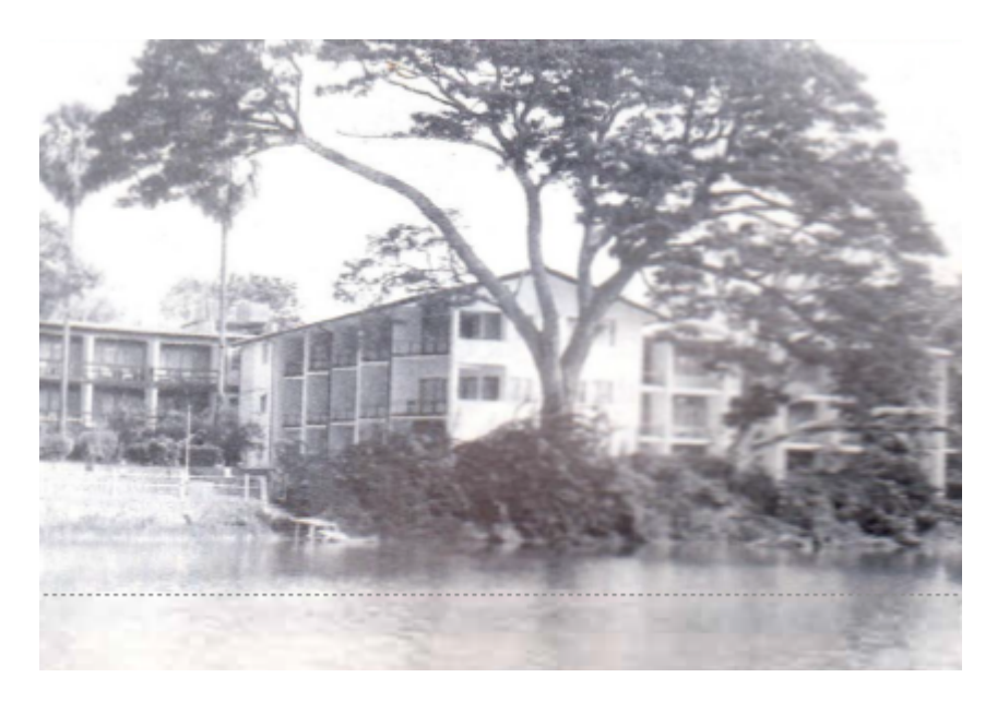
The modern resthouse at Tissamaharama

What CHC describes as Wayside Stopovers are the resthouses of Ambepussa on the Kandy-Colombo Road, Pussellawa Resthouse on the Kandy-Nuwara Eliya Road and Habarana at the main junction or crossroads to the North and East in the North Central Province. But all these are bases from which to leisurely 'do' the surrounding most fascinating and full of flavor countryside. Tea gardens, spice gardens, walks, drives, parks, ancient monuments, perennial villages and lifestyles and modern marvels like the Mahaweli Development Scheme can be visited from these places - or one could simply relax. It is the visitor's choice-and he will love to return and be pampered in the resthouses of the Ceylon Hotels Corporation.