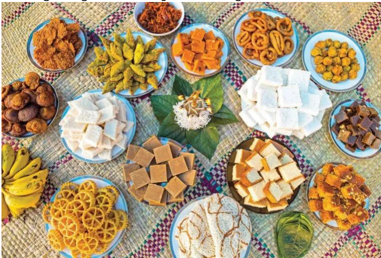
Avurudu sweets are part of the festival's tradition