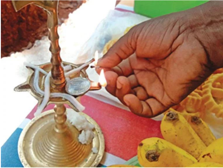
The lighting of oil lamp reflects good fortune.