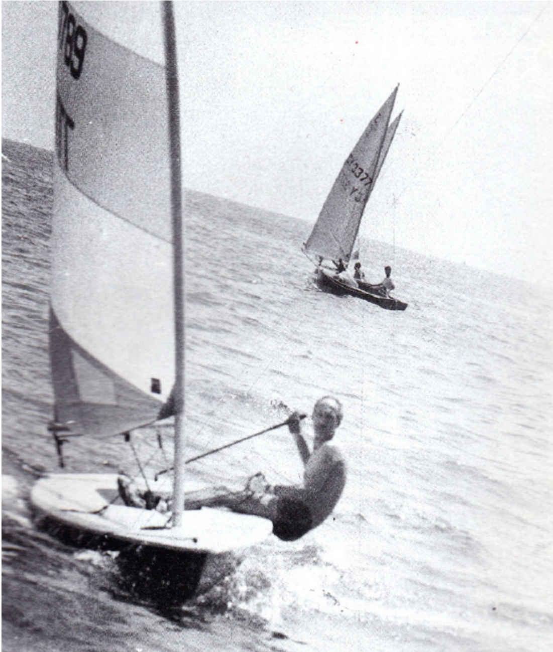
The single-handed Lazer pulling out in front.