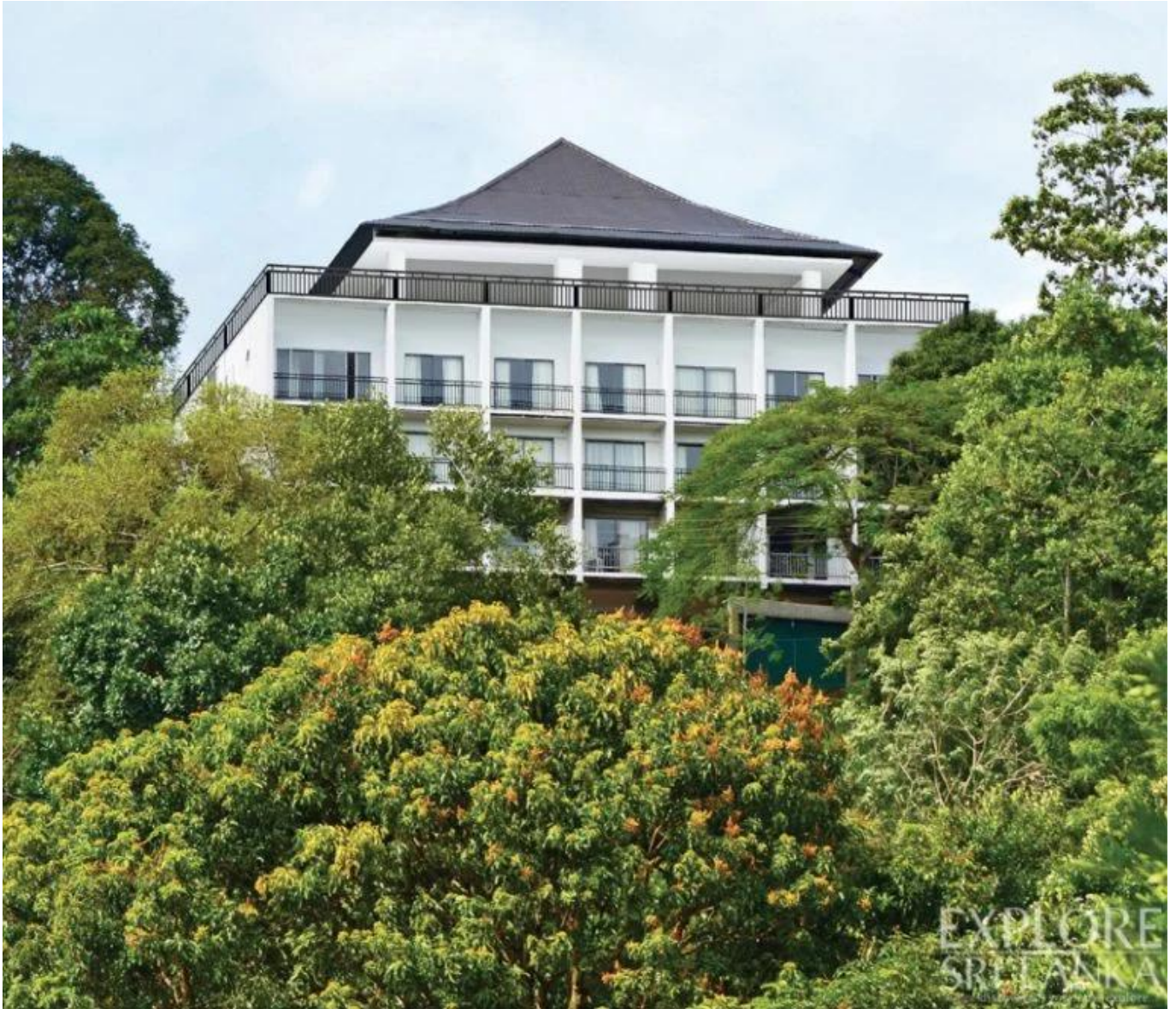
The facade of the Swiss Residence hidden amidst the greenery

The mesmerizing view of the lush greenery and emerald mountain ranges that formed the backdrop for The Swiss Residence took our breath away. The hotel offers a serene getaway sheathed in the pristine beauty of the hill country.