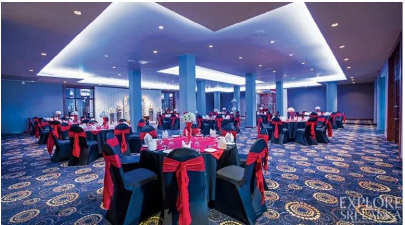
The Grand Ballroom

With 39 rooms spread across the premises, The Swiss Residence has Superior Rooms and Deluxe Rooms for guests to select from. The 12 Superior Rooms are well furnished with an aura of warmth enhanced by subtle and soothing touches. The bathtubs in each Superior Room are separated by a glass panel adding a charming effect to the rooms. The interconnecting Superior Rooms are perfect for families. The Deluxe Rooms are comfortable and spacious each complete with modern amenities. All the rooms are charismatically designed and offer stunning views.