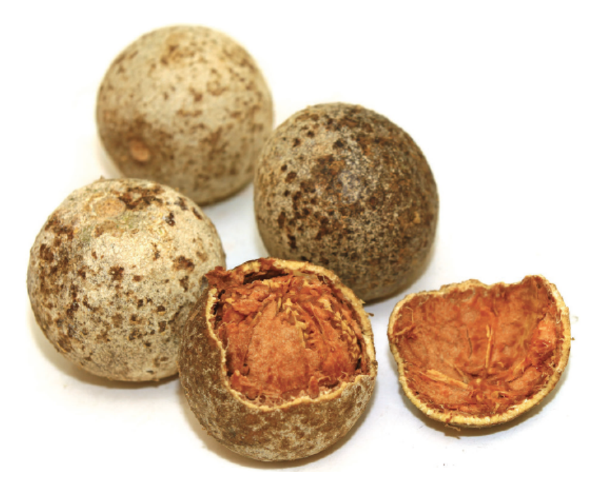
Ripe wood apples have a strong, pungent smell.