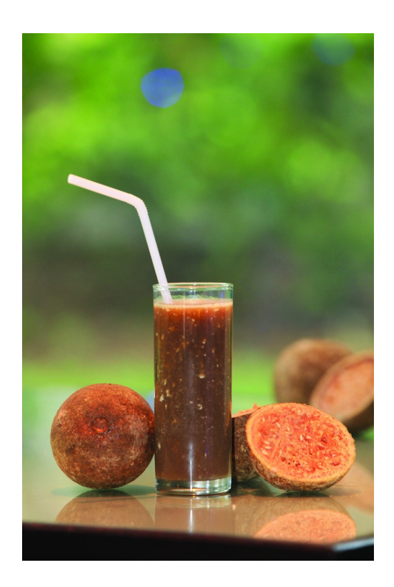
Refreshing Divul Kiri.