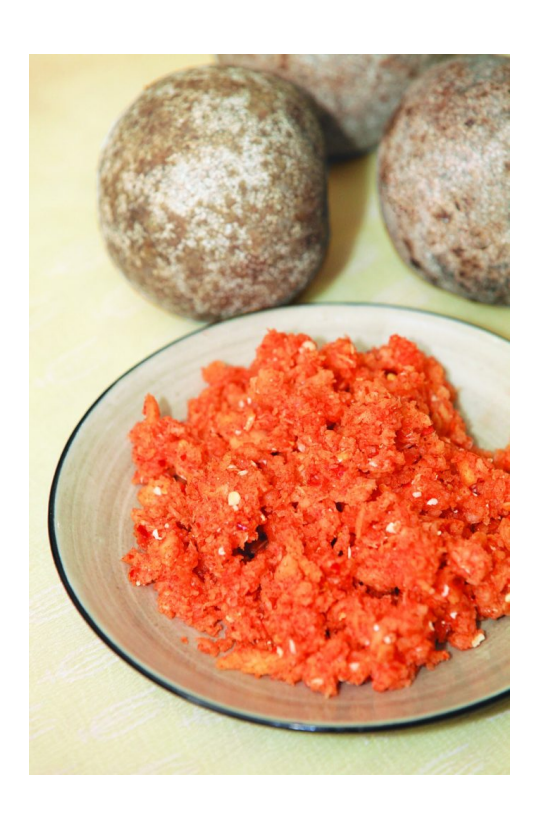
Spicy Divul Sambol is a fine island delicacy.

The divul can be tried out in various sweet, sour, or savory combinations. Culinary styles have experimented with it using salads, and their juicy texture makes them fabulous for preparing jams and chutneys. The more pungent the smell of the fruit is a sign that the fruit is ripe and ready to eat. The fruit is rich in anti-microbial properties, carbohydrates, calcium, Vitamin C, iron, phosphorus, and other minerals. It is an excellent source of energy too. This highly nutritious fruit can cure digestive disorders, sore throats, and gum ailments.