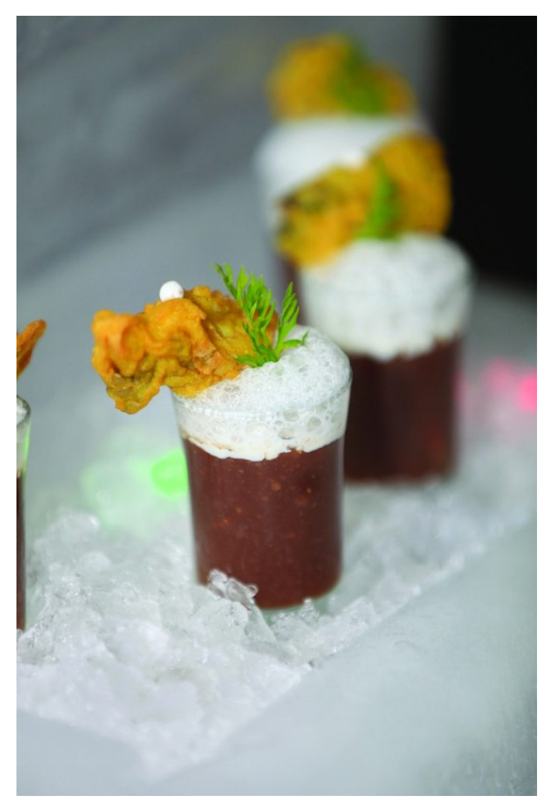
Wood apple shooter with coconut foam and oyster tempura.