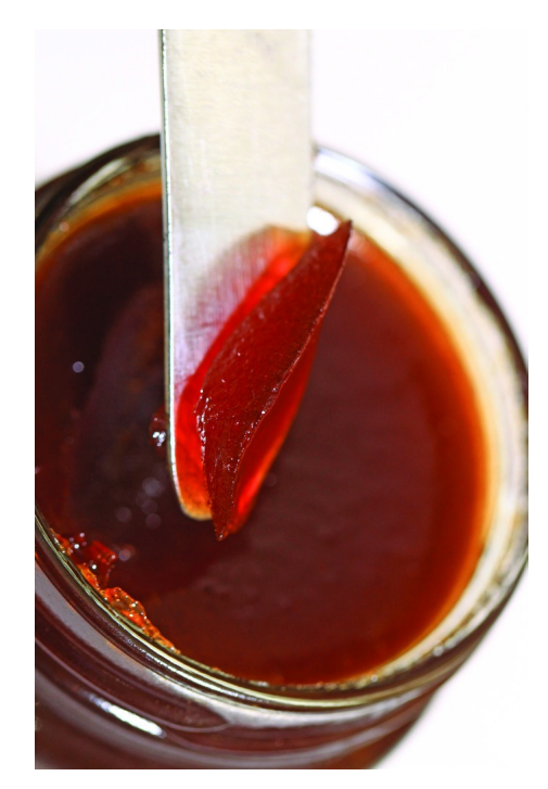
Sweet wood apple jam

sacred fruit and offer it to the Hindu deity God Ganesh during Vinayaga Chathurthi (the birthday of God Ganesh). Divul is loaded with a perfect balance of tanginess, delightful taste, and plenty of nutrients and continues to capture the hearts of those who savor it every time.