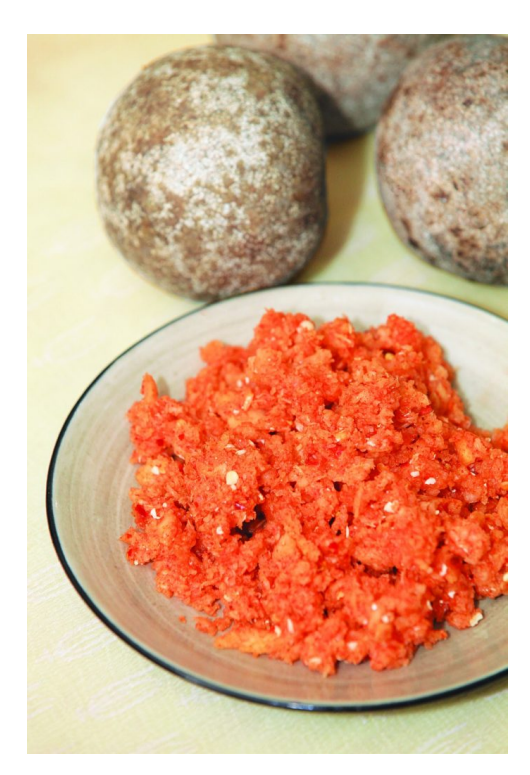
Spicy Divul Sambol is a fine island delicacy.

The divul can be tried out in various sweet, sour, or savory combinations. Culinary styles have experimented with it using salads, and their juicy texture makes them fabulous for preparing jams and chutneys. The more pungent the smell of the fruit is a sign that the fruit is ripe and ready to eat. The fruit is rich in anti-microbial properties, carbohydrates, calcium, Vitamin C, iron, phosphorus, and other minerals. It is an excellent source of energy too. This highly nutritious fruit can cure digestive disorders, sore throats, and gum ailments.