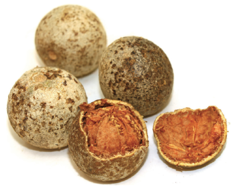
Ripe wood apples have a strong, pungent smell.