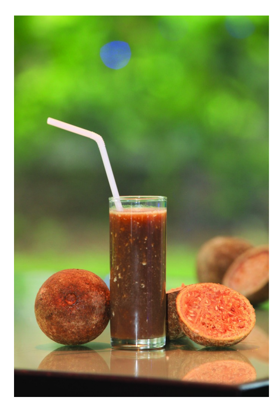
Refreshing Divul Kiri.