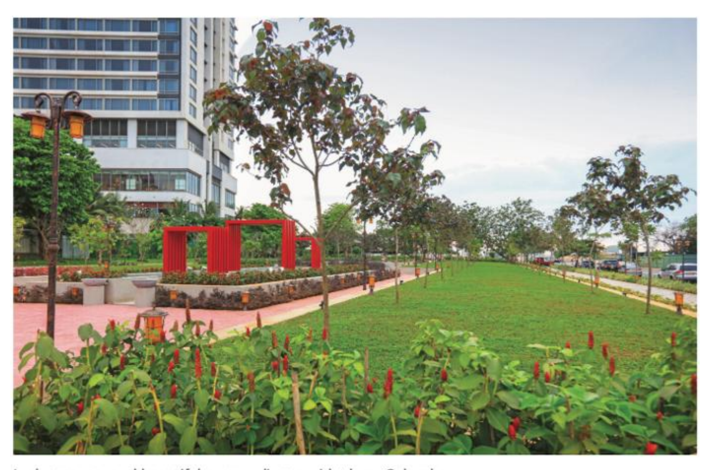
Lush greenery and beautiful surroundings amidst busy Colombo.