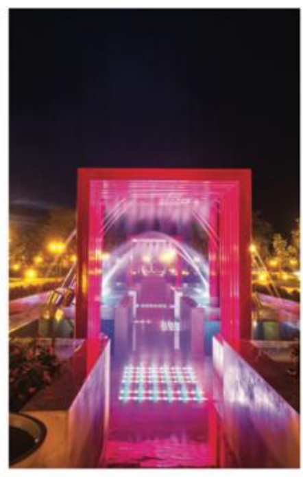
First of a kind water show with bright lights is another beautiful attraction.