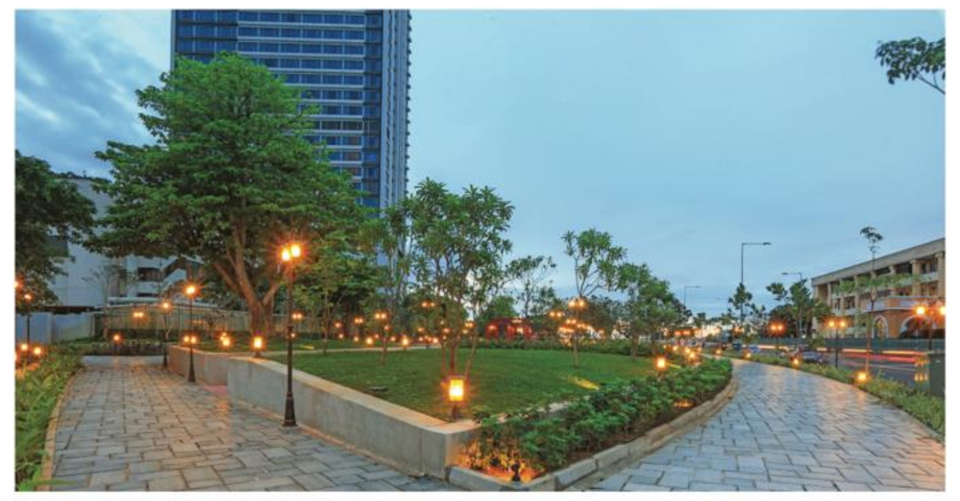
Neat and ample walking paths to enjoy the bliss of nature.