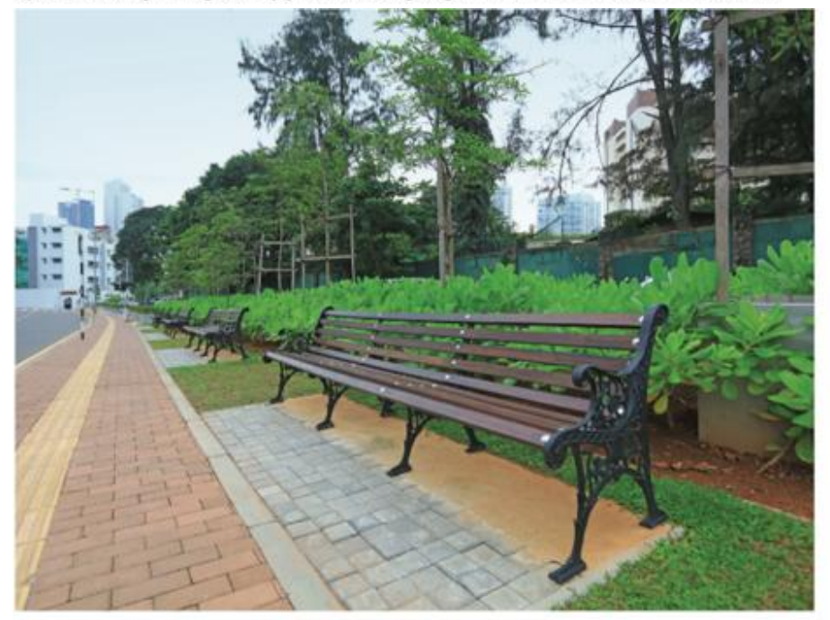
Spaces to relax after a hearty stroll.