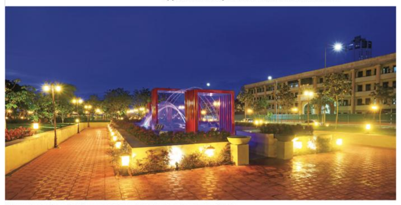
Water park area of the urban forest at twilight exudes a charming and soothing ambiance.