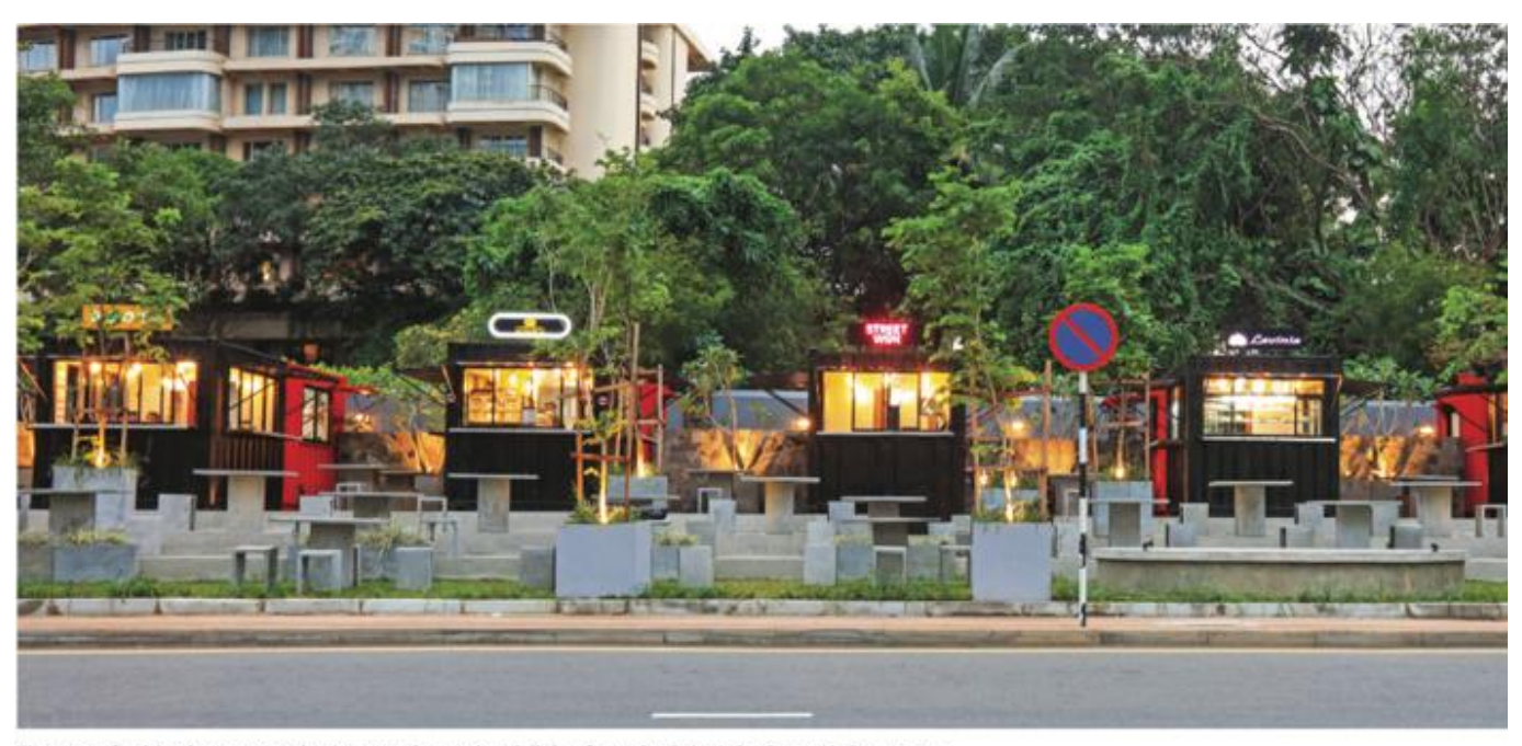
Sip on a refreshing beverage and enjoy mouthwatering delights from the Beira Lake Open Air Restaurant.