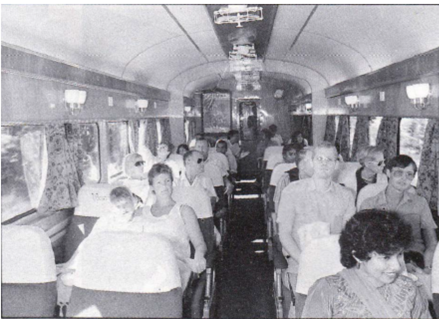
The spacious and comfortable interior of the locomotive.