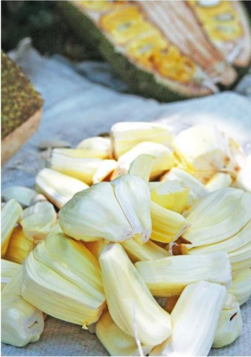
Jackfruit bulbs vary in size, shape, and texture.