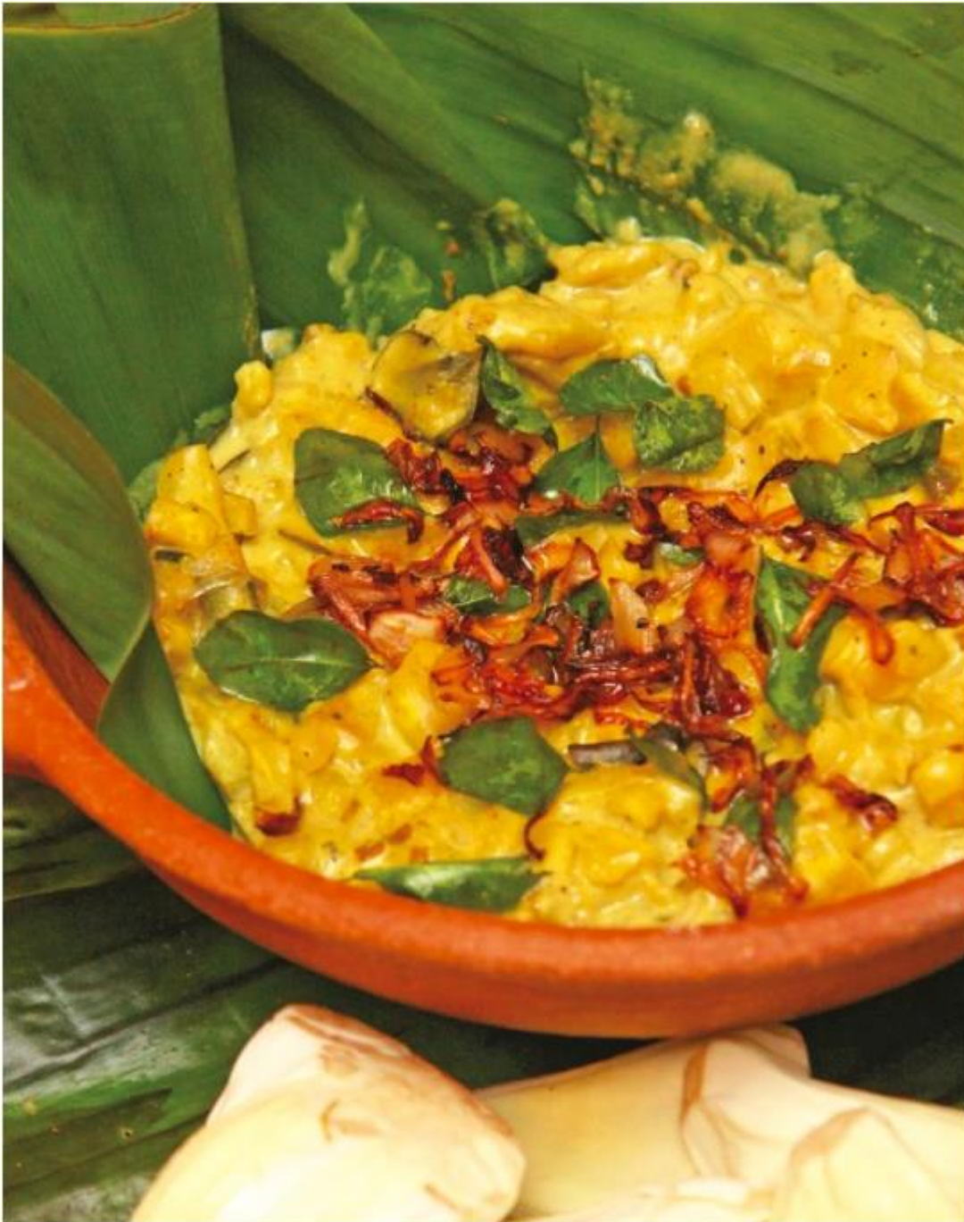
Kiri Kos is a mild and creamy accompaniment with rice.