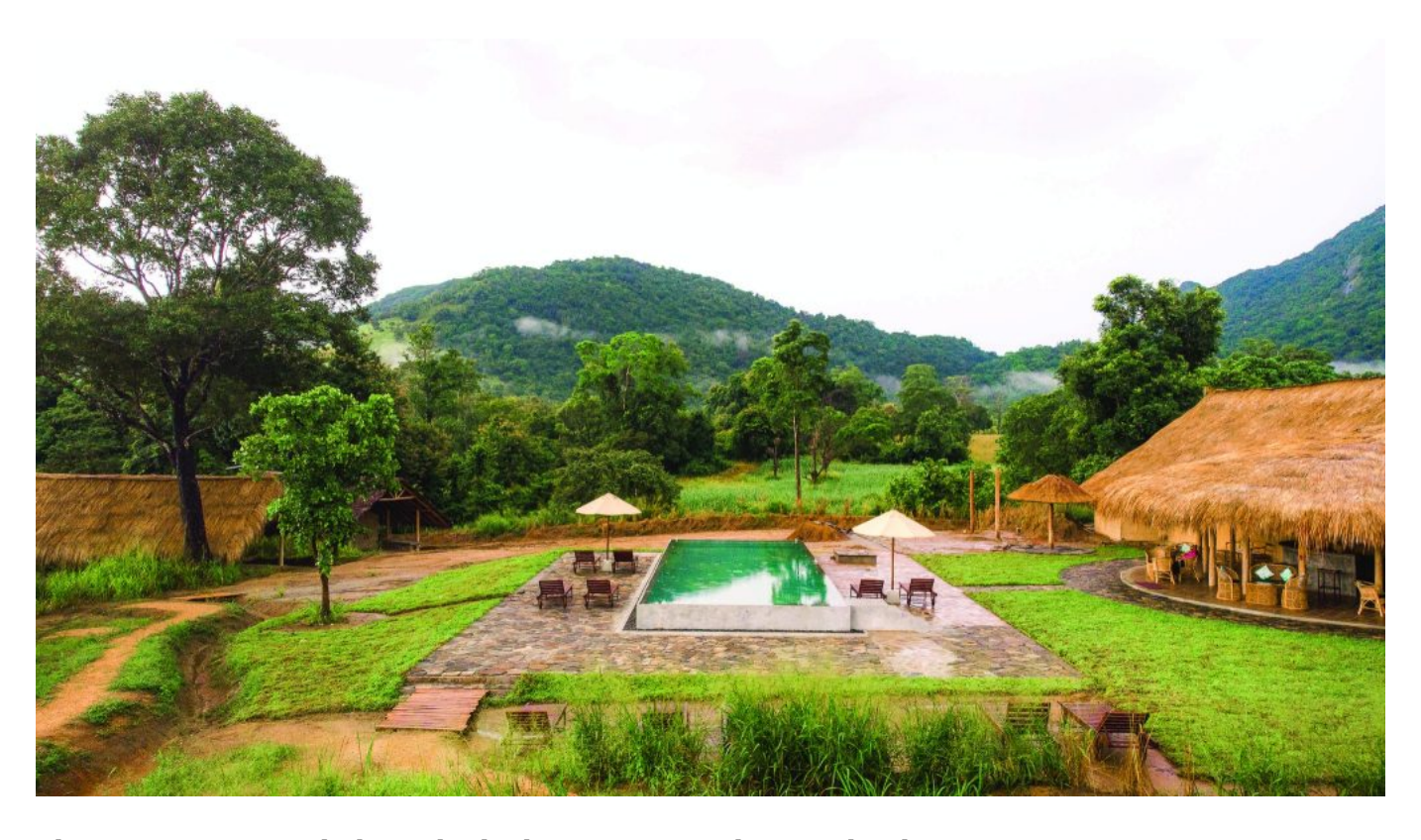
The property is settled amidst lush greenery and a vast landscape.