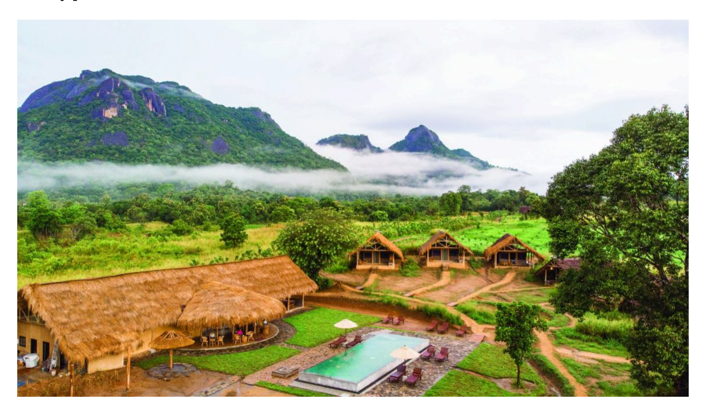
Scenic view at Wild Glamping Gal Oya.

The Wild Glamping Gal Oya tented luxury chalets join the Theme Resorts portfolio amidst the COVID-19 pandemic. It is situated in a 30-acre good practice agriculture farm in the Galoya Valley at Rathugala. The property consists of 10 spacious tents, a restaurant and an infinity pool.