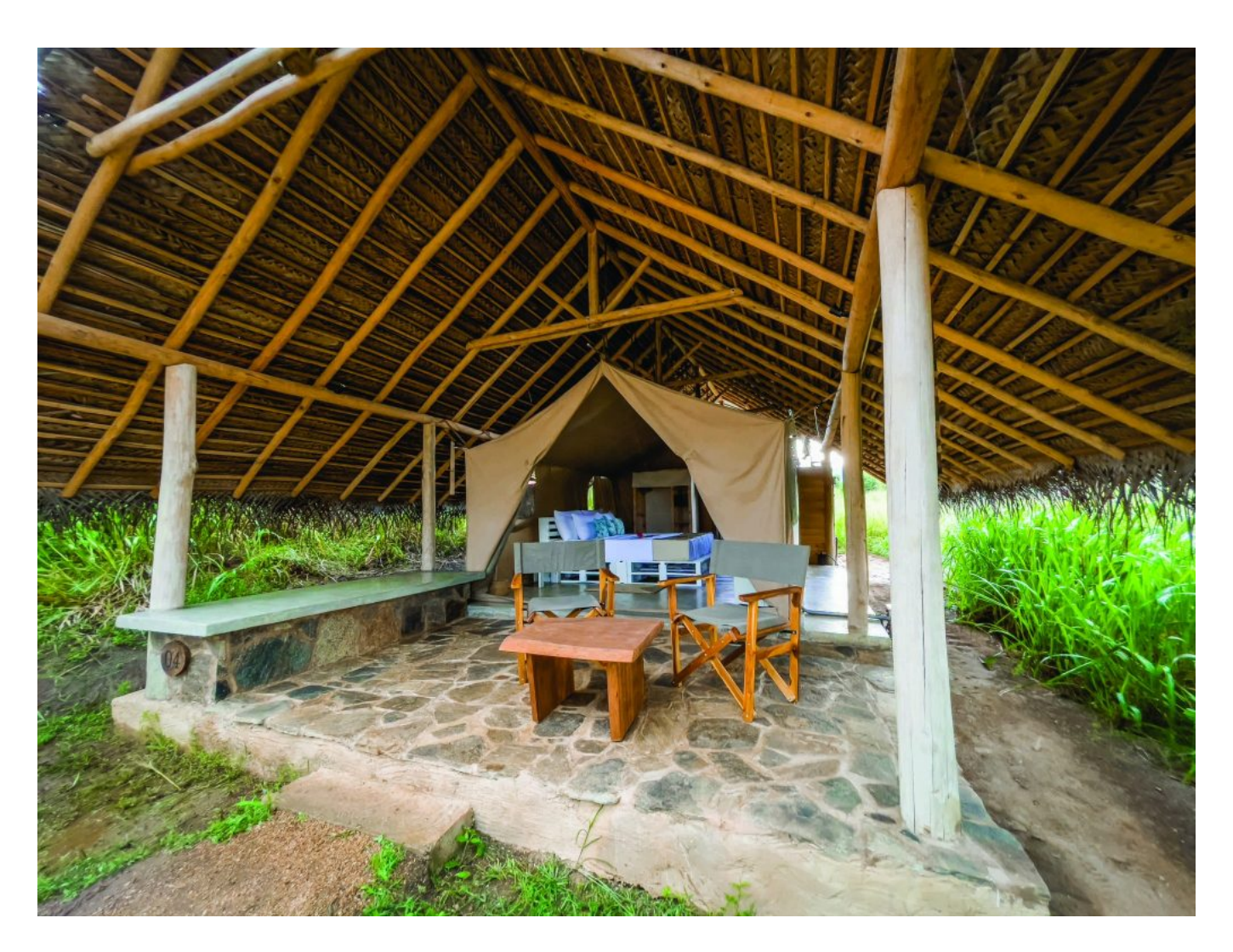
Eco-friendly designs are used to maximize the use of natural light and ventilation.

The interiors reflect an artistic ambiance.