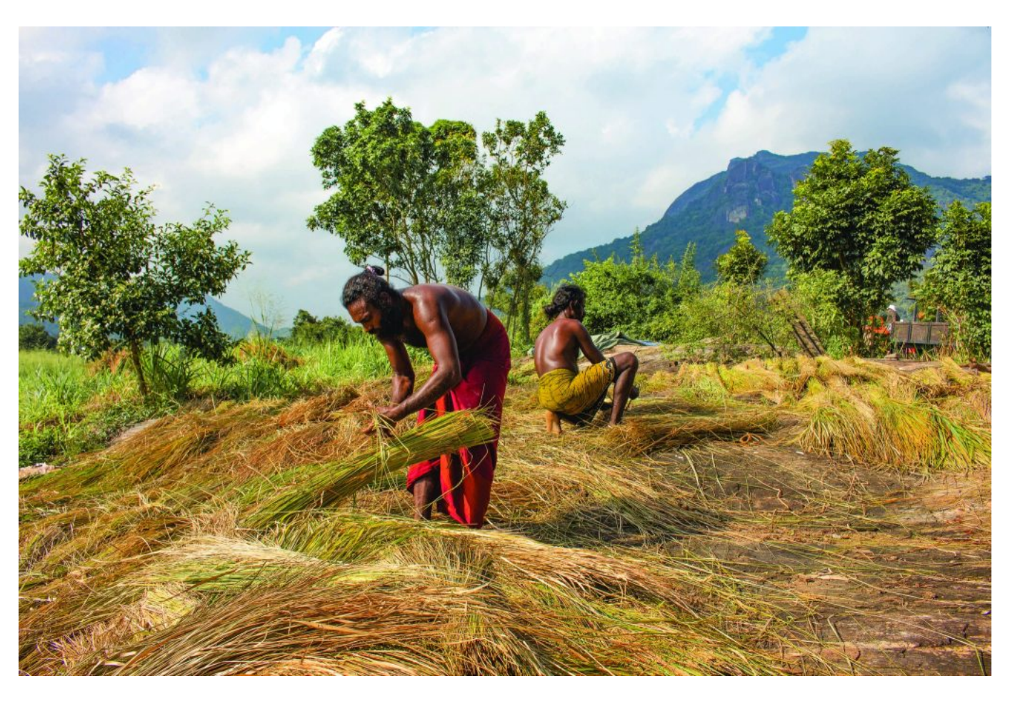
Employment opportunities are provided for locals in the neighboring indigenous communities.