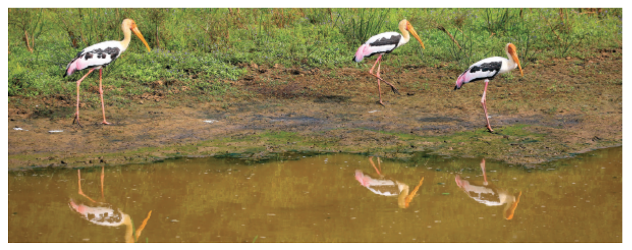
Painted Storks foraging for their meal.

underwater. However, on the day we traveled the river was a small stream, as rains had not reached as yet. The water of the river was clear and cooling.