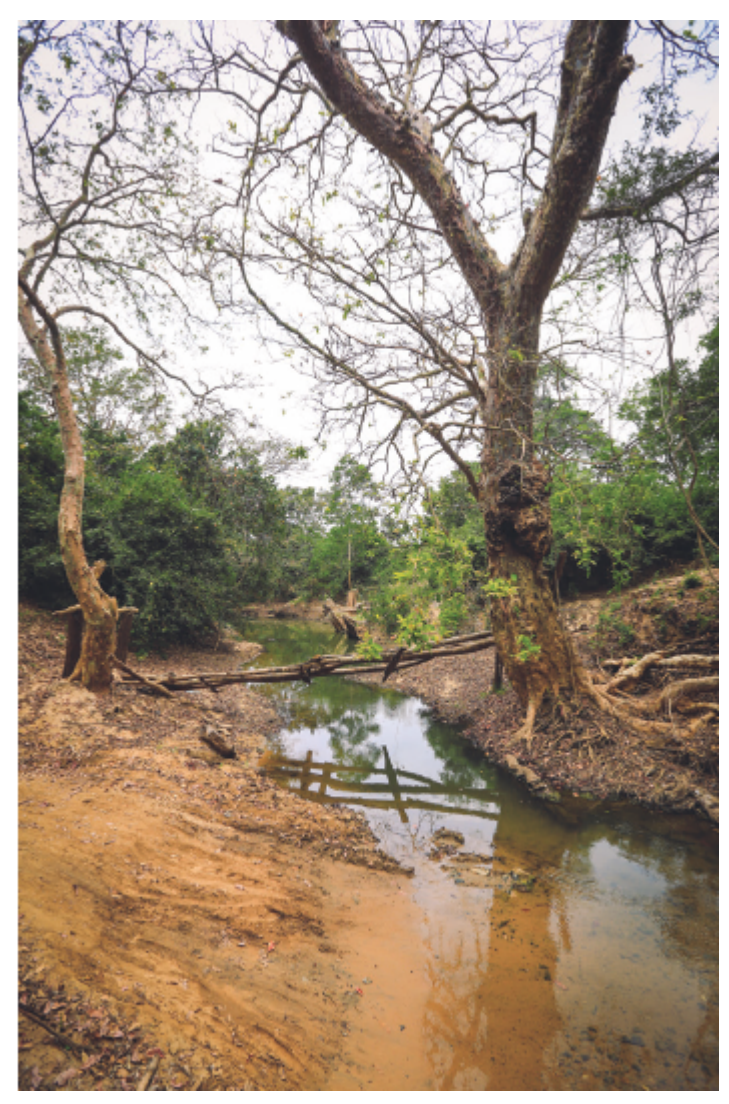
The Angun Ara provides water to the area.

rosy pink but green as it was still the cultivating season. From little to larger fruits, and flowers too could be seen. Kilo pera is ideal with salt and pepper sprinkled on chunky pieces and the red kernels of the delum fruit are consumed as it is. Journeying back towards the expressway, we were mesmerized by the impressive structure of the sluice gates of the Lunugamvehera reservoir and the surrounding waters. Acres of banana cultivation could also be seen from the bridge. In all areas the new season of cultivation had just started thus the trees were starting to bear fruit. From Mattala, we entered the expressway and we were in Colombo in less than two and a half hours. We had seemingly done the impossible, we had traveled to Buttala and returned in a day.