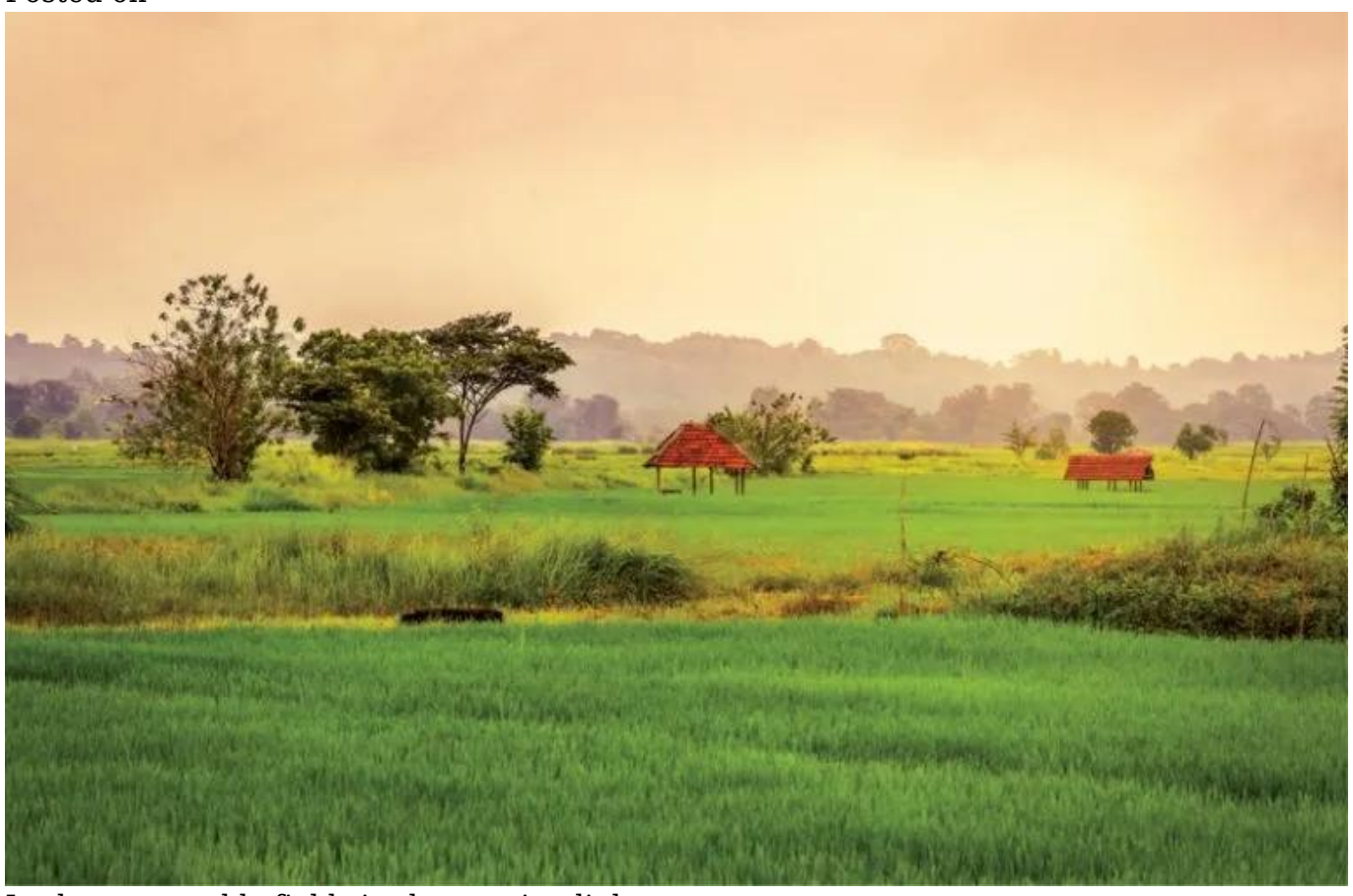
Lush green paddy fields in the evening light

We were indecisive on which way to go, yet the name 'Girandurukotte' seemed to beckon us. Along peaceful and quiet roads, we headed immersed in the beauty of rural Sri Lanka.