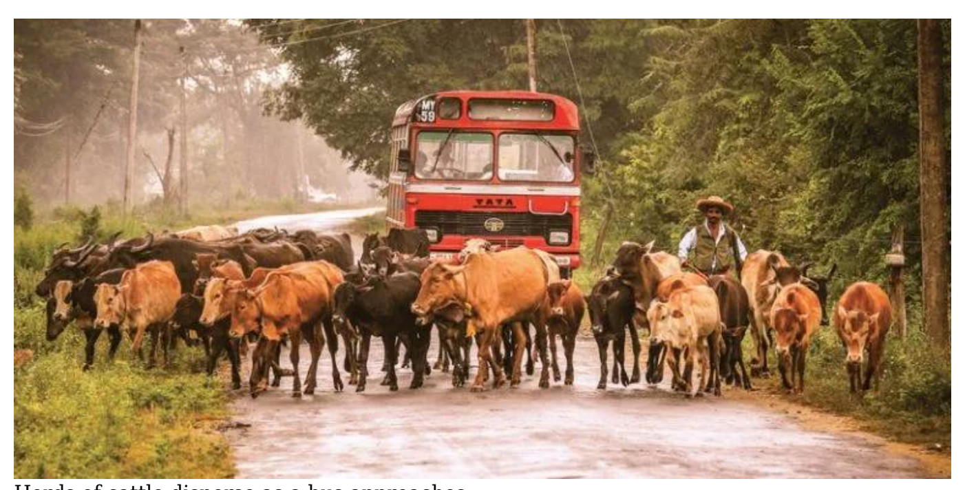
Herds of cattle disperse as a bus approaches

Reaching Girandurukotte we continued on, seeking places of interest. An archaeological site drew our attention, it was a simple stupa like structure but there was no description and none could explain its significance. Corn fields came into view, many had been harvested. One of the farmers offered us fresh corn that had been recently collected. He insisted that we should try the raw kernels and we did. It had a soft texture with a creamy taste. Munching on the corn we continued on our journey.