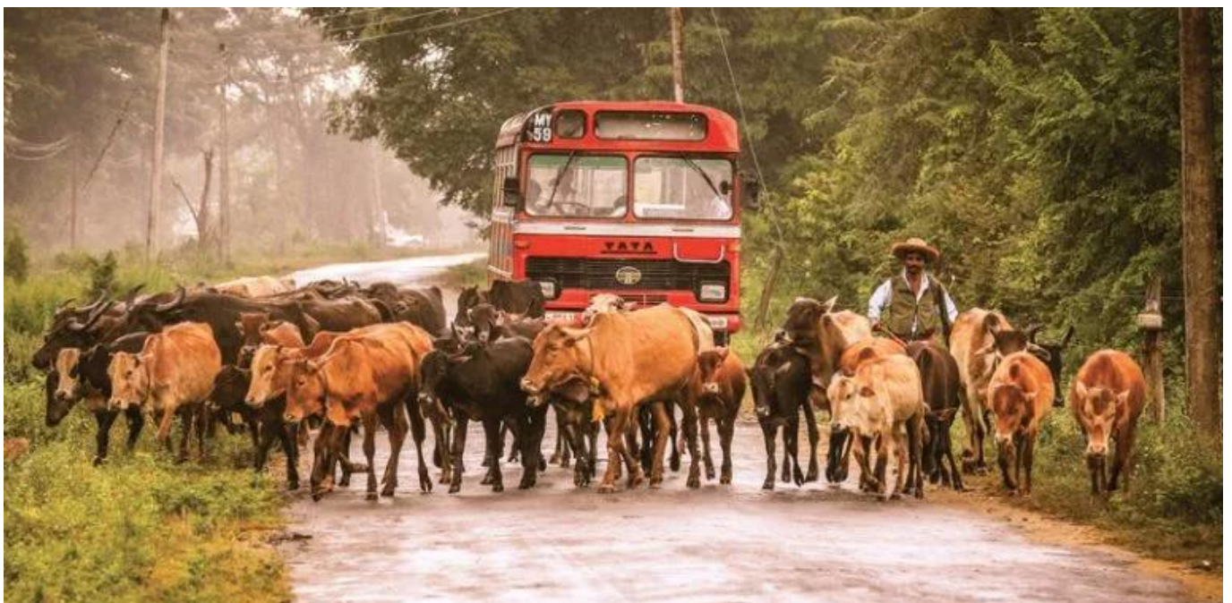
Herds of cattle disperse as a bus approaches

Reaching Girandurukotte we continued on, seeking places of interest. An archaeological site drew our attention, it was a simple stupa like structure but there was no description and none could explain its significance. Corn fields came into view, many had been harvested. One of the farmers offered us fresh corn that had been recently collected. He insisted that we should try the raw kernels and we did. It had a soft texture with a creamy taste. Munching on the corn we continued on our journey.