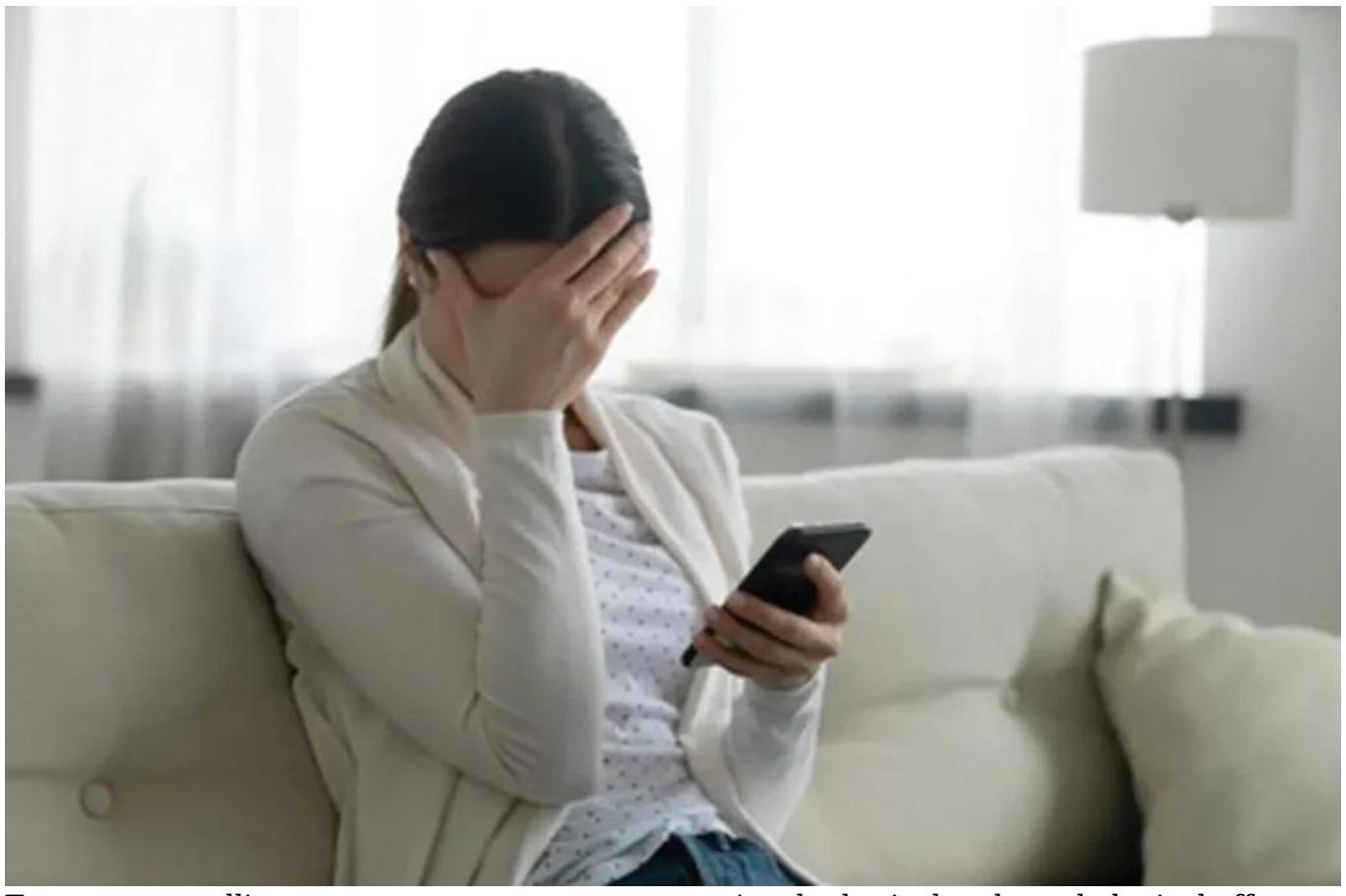
Trauma counselling can support to overcome emotional, physical and psychological effects.