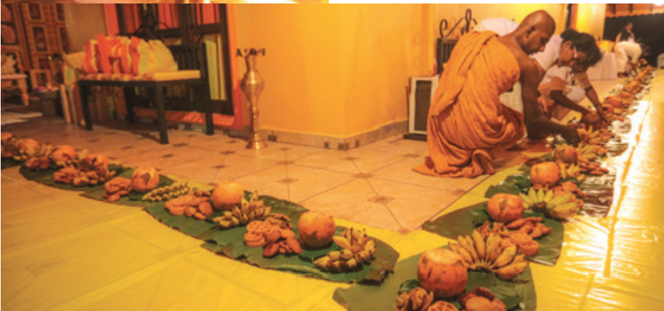
Preparations for the dana are done with care.