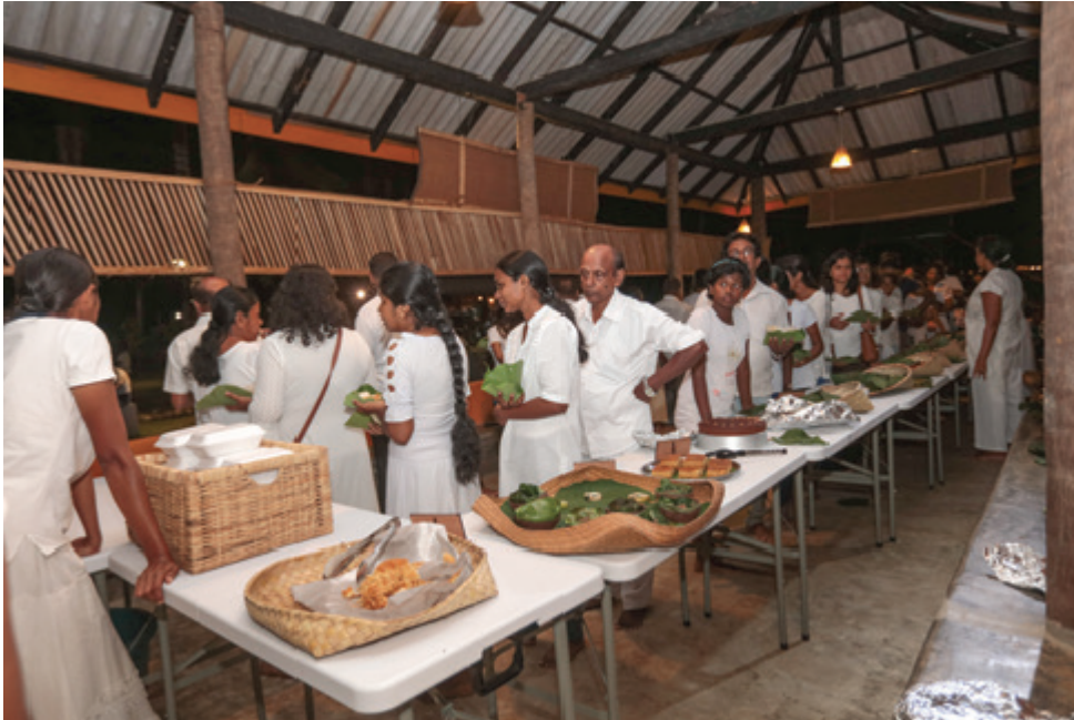
Devotees at the 'Ahara Salpila' (food festival).