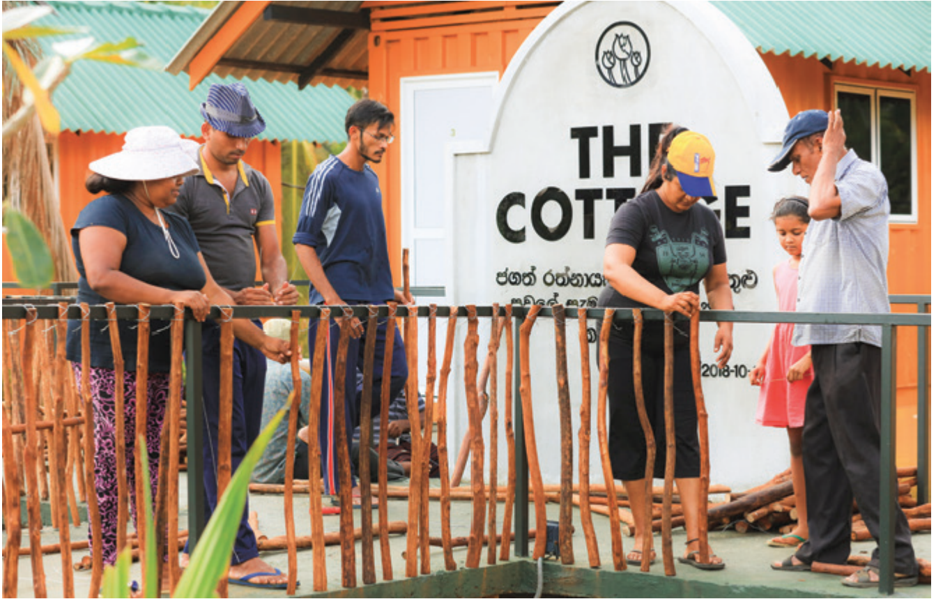
Volunteers in preparation for the day's program.