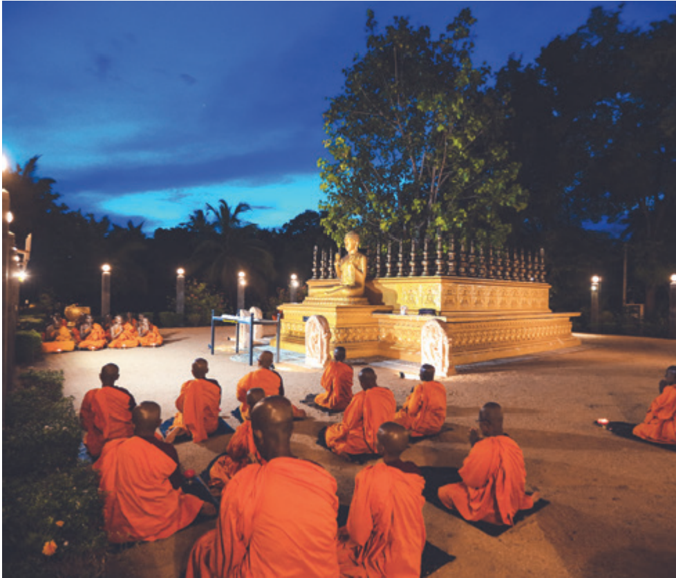
Meditation amidst the serene surroundings.