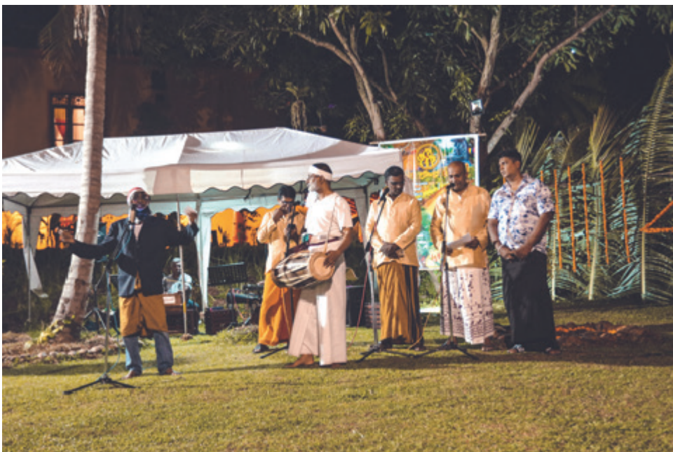
The cultural performances displayed the talents of many.