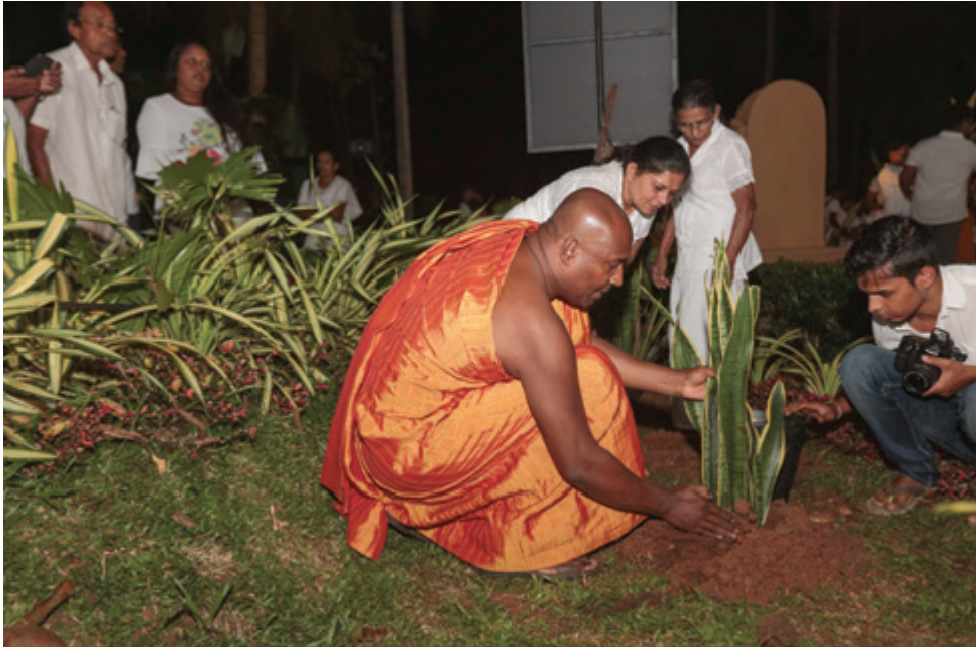
The planting of the first Sansevieria (snake plant) by the Thero.