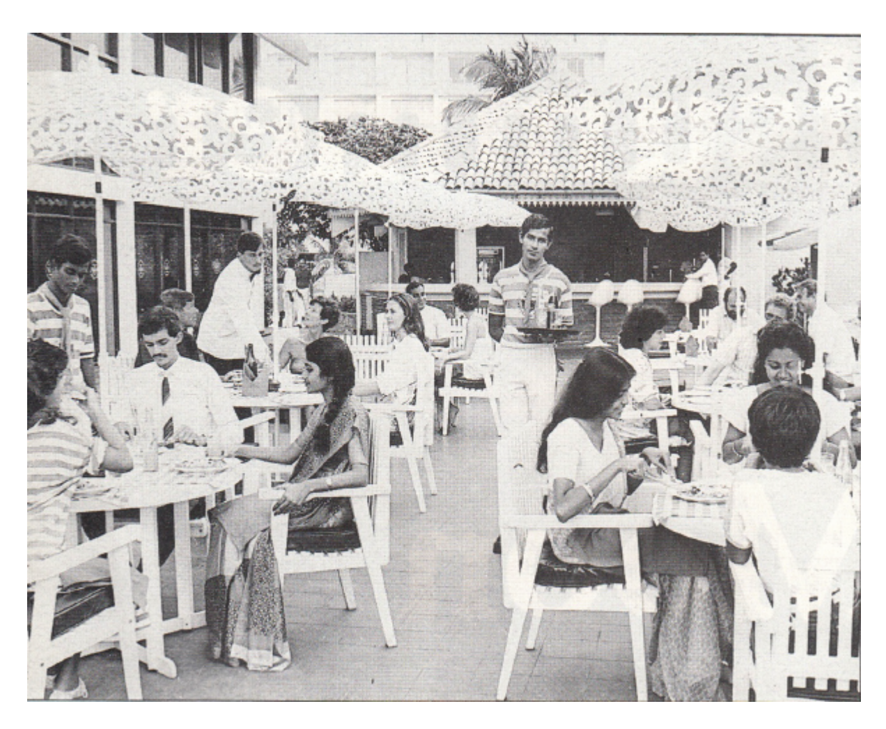
The Pizzeria - Inter Continental

Like lovers, schizophrenics and mating crustaceans the island of Sri Lanka is definitely moonstruck. It's not just that in a predominantly Buddhist country, full moon days are festival nor even that the country's stunning variety of landscapes is, without exception, best appreciated by moonlight. No, it's something deeper than that, a resonance in the