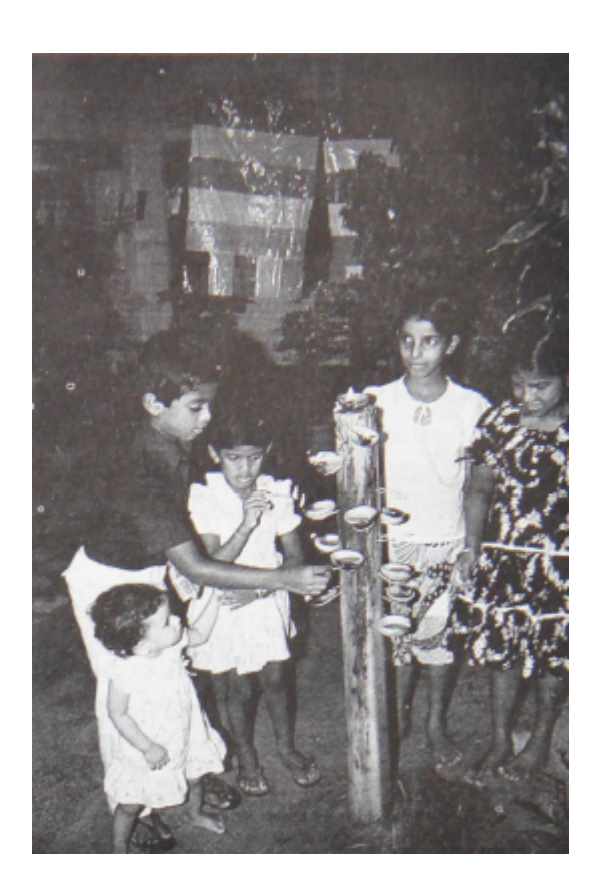
Top right: Coconut oil lamps are lit for the Buddha as offerings of light.