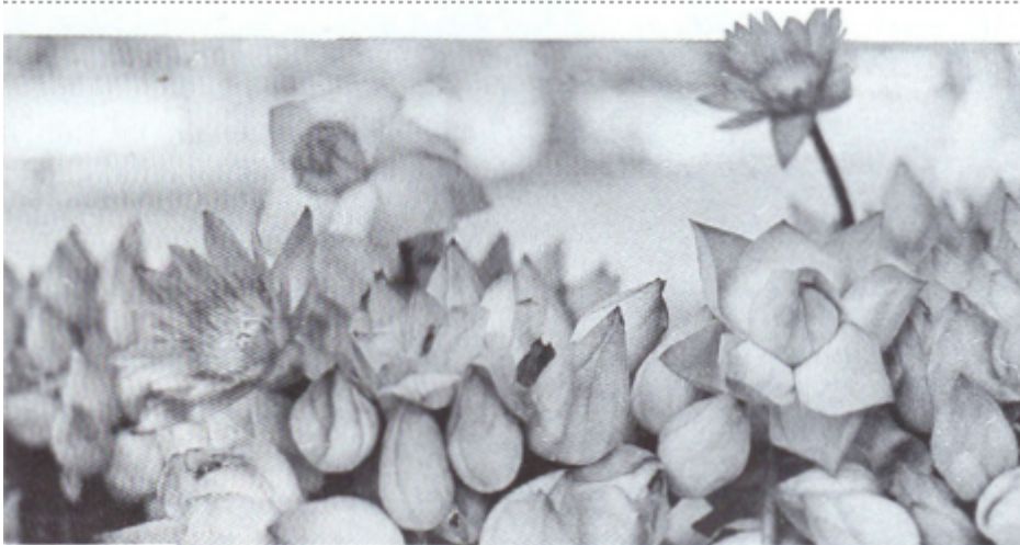
A host of pink lotuses offered to the Buddha on Vesak