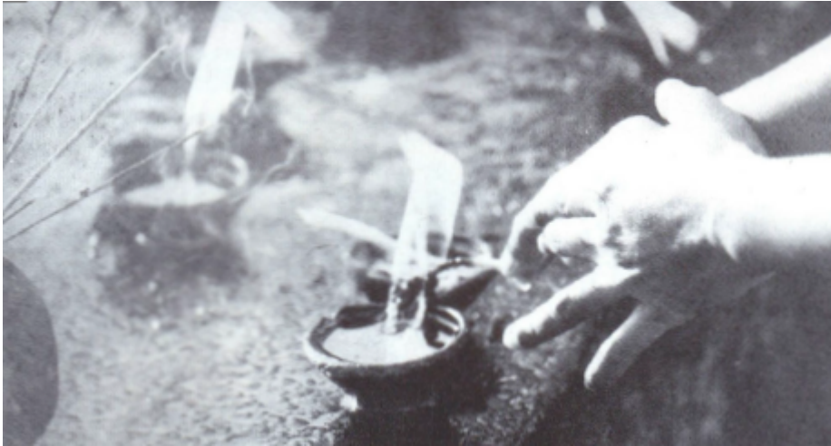
Scent and light – joss sticks and clay lamps are among the offerings made to the Buddha.