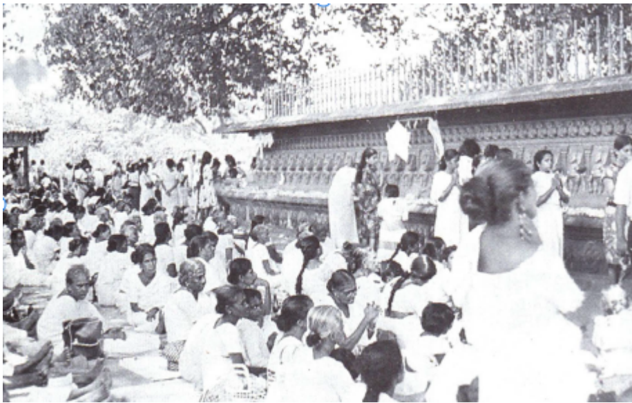
Buddhist worshipping at the Bo -tree Kelaniya temple on a full moon day (Janeth Rodrigo)

From little clay lamps burning coconut oil lit at the entrance to a small rural shack or a hut in the jungle to the hundreds of such lamps lit all along the boundaries of larger homes, and the thousands of electric jets that light up richer homes and public buildings, the types of illumination has a genius, artistry, skill and purse would permit.