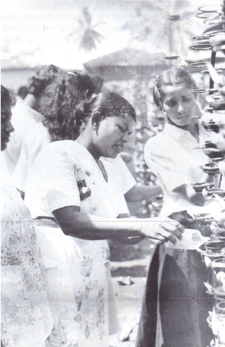
Devotees pour coconut oil to light the hundreds of clay lamps lit at the temples on Vesak day