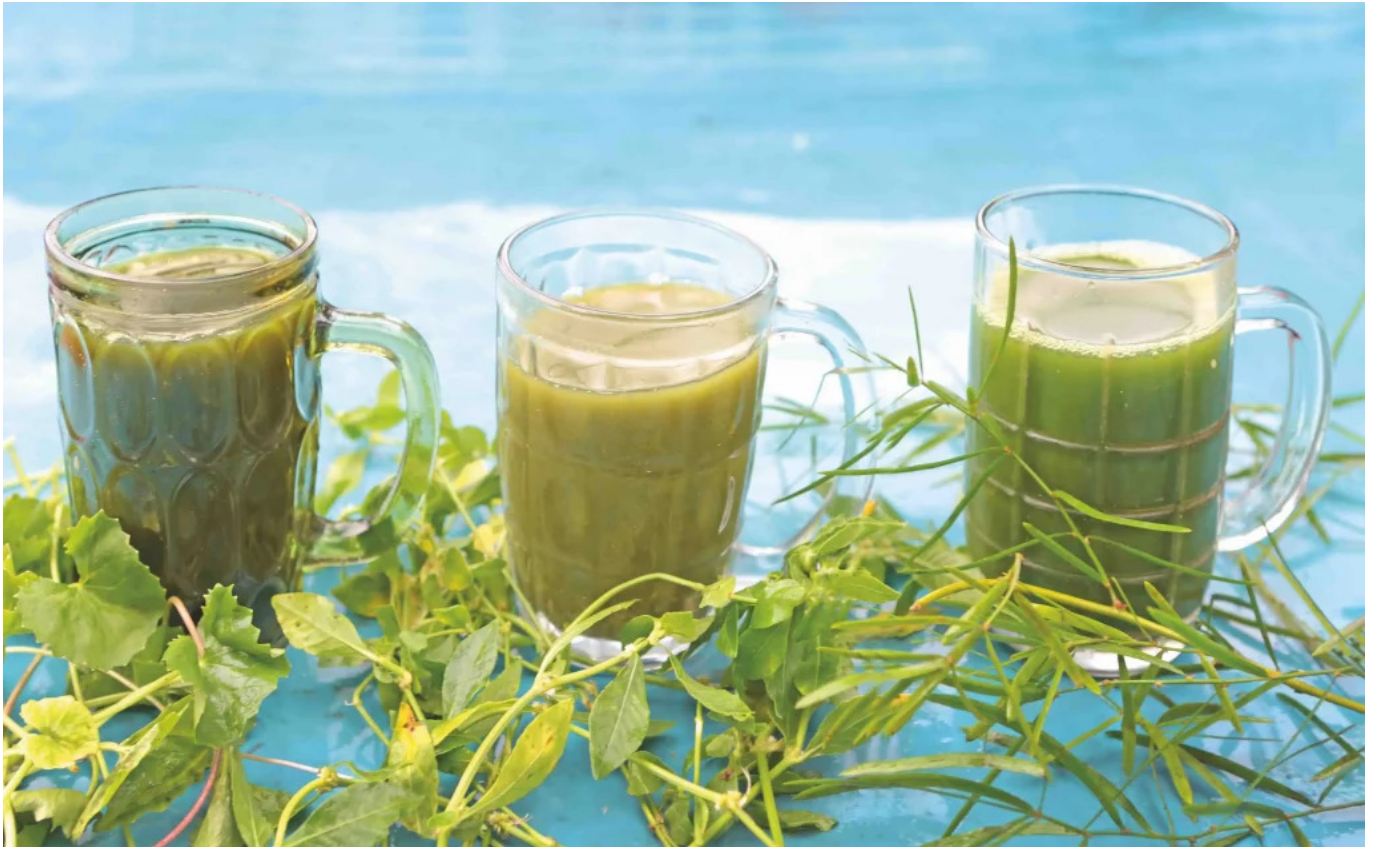
Gotu Kola, Mukunuwenna and Hathawariya kenda.

Most Sri Lankans gulp down a morning mug of Kenda, a veritable magic potion that gives the drinker strength to face the day.