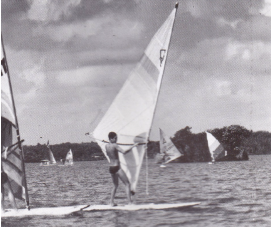
Trying out individual sailing skills.