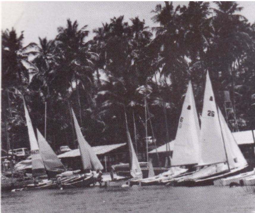
Yachts moored at Bolgoda Lake.

CRYC at Harbour Waterfront, Kochchikade (Colombo) CMYC at Indibedda, Moratuwa.