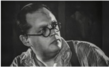
Lionel Wendt (1900–1944)