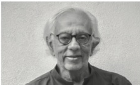
Tilak Samarawickrema (1943)