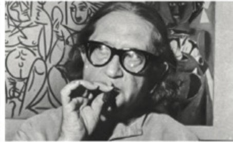
George Keyt (1901–1993)