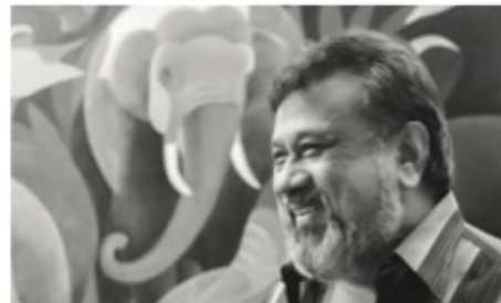
Senaka Senanayake (1951)